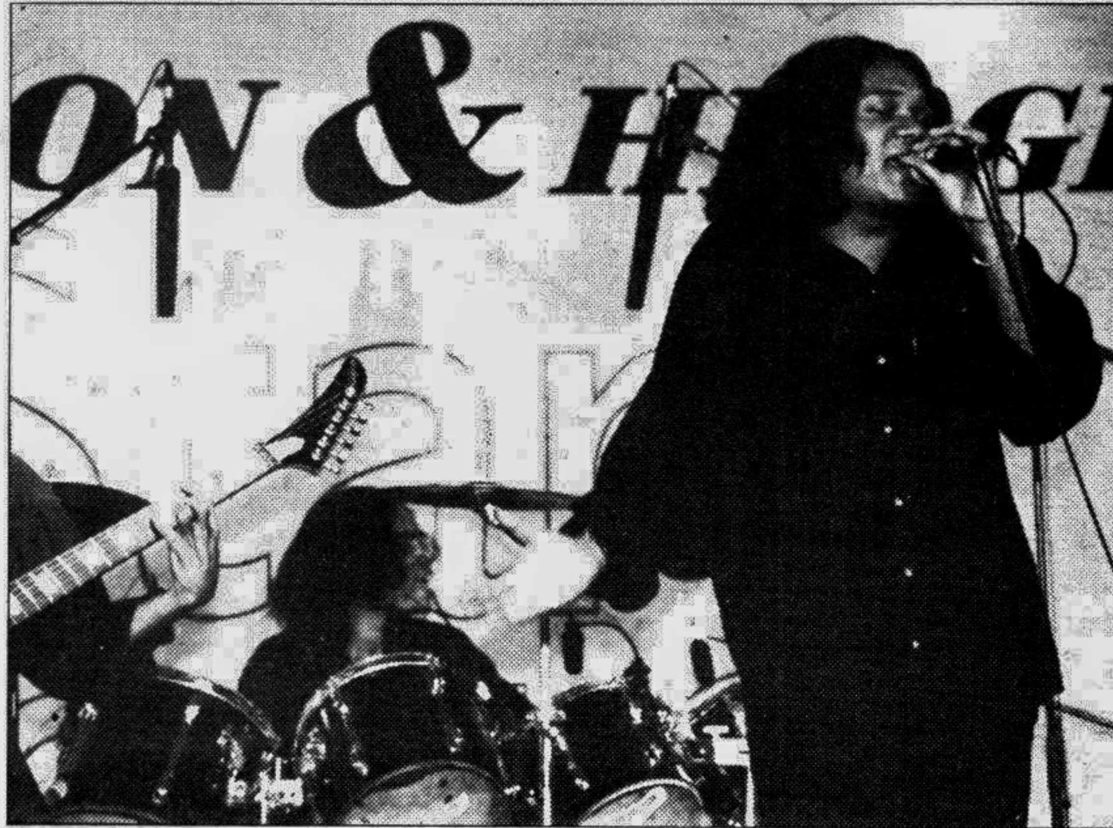
VIKINGS — THE WINNER

From the chirping of a bird to the humming of a gay girl- it's all music. Shakespeare said 'if music be the food of love play on.' But these days music is no more the food of love only it has become means for earning food. It means business too. Promoting a musician means a lot today. It has always been YEP FORUM'S objective to promote the younger generation. Whenever Yep Talk had an opportunity it always tried to highlight the activities of the young members of its different chapters. Today's page is being dedicated to the young musicians.