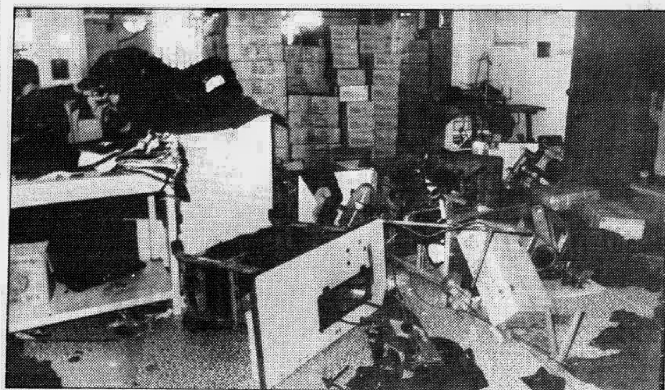
A partial view of the ravaged garment factory of Dhaka Dyeing. The picture was taken yesterday.