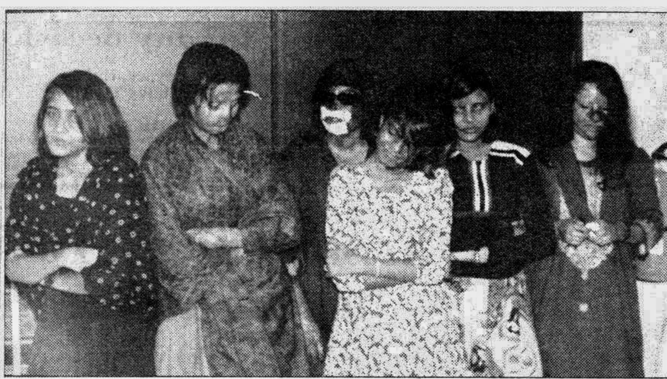
Acid-burn victims returned home yesterday from Spain after having treatment there.