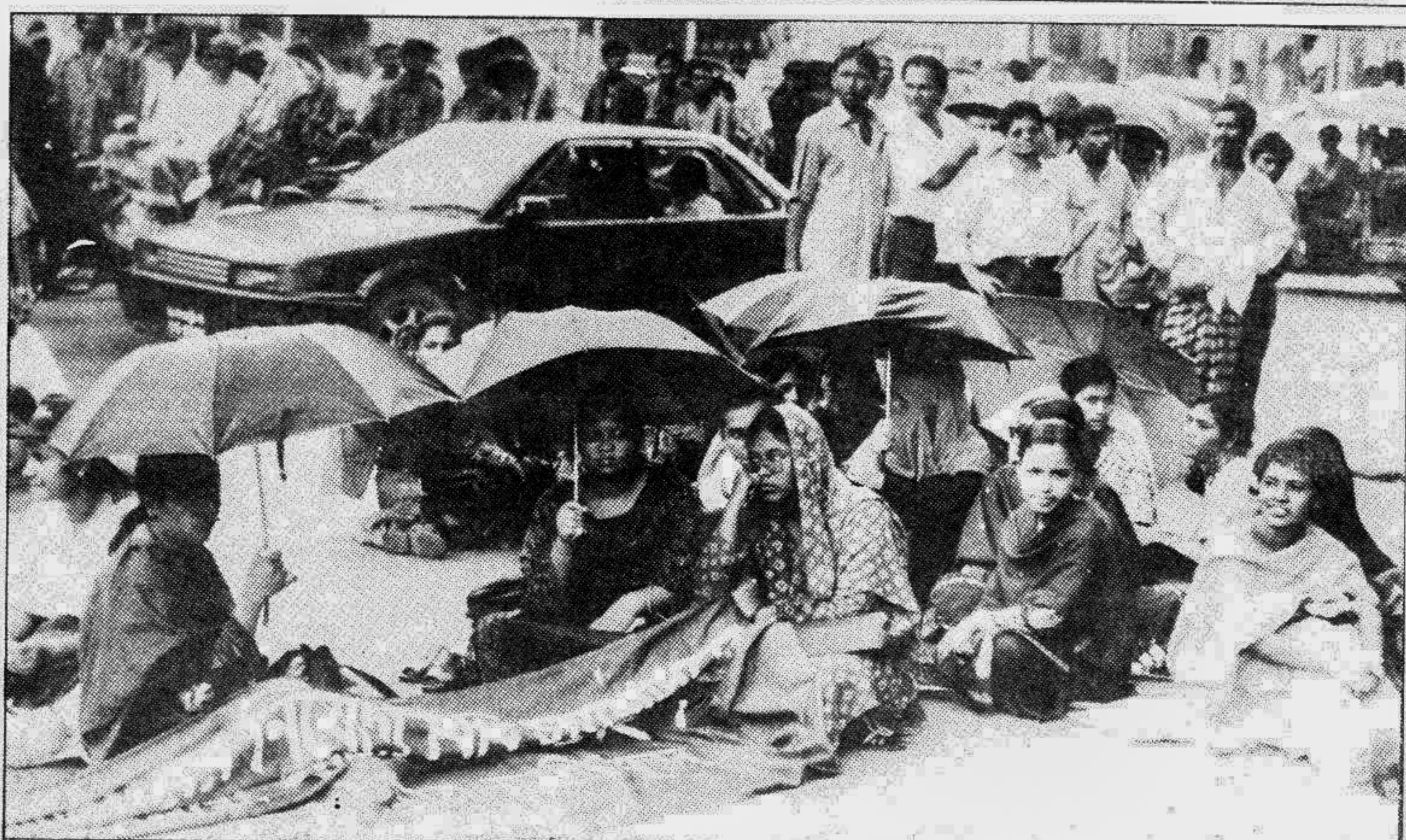
Zoology students stage a sit-in strike in front of the National Press Club yesterday demanding review of BCS rules for Fishery officers.