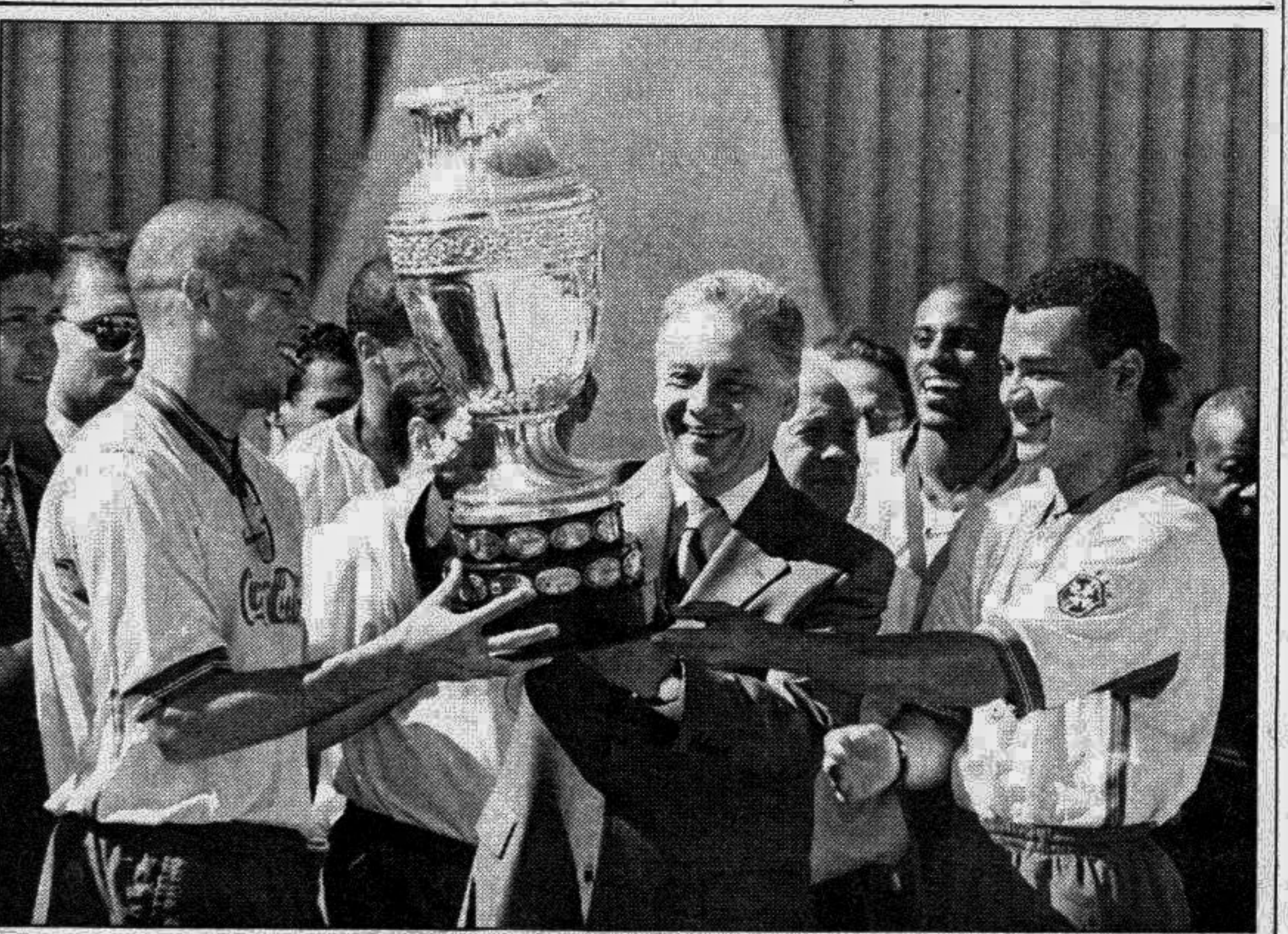
A PROUD MOMENT: Brazilian President Fernando Henrique Cardoso (C) being shown the Copa America by captain Cafu (R) and Ronaldo during a reception at the presidential palace in Brasilia on July 19.