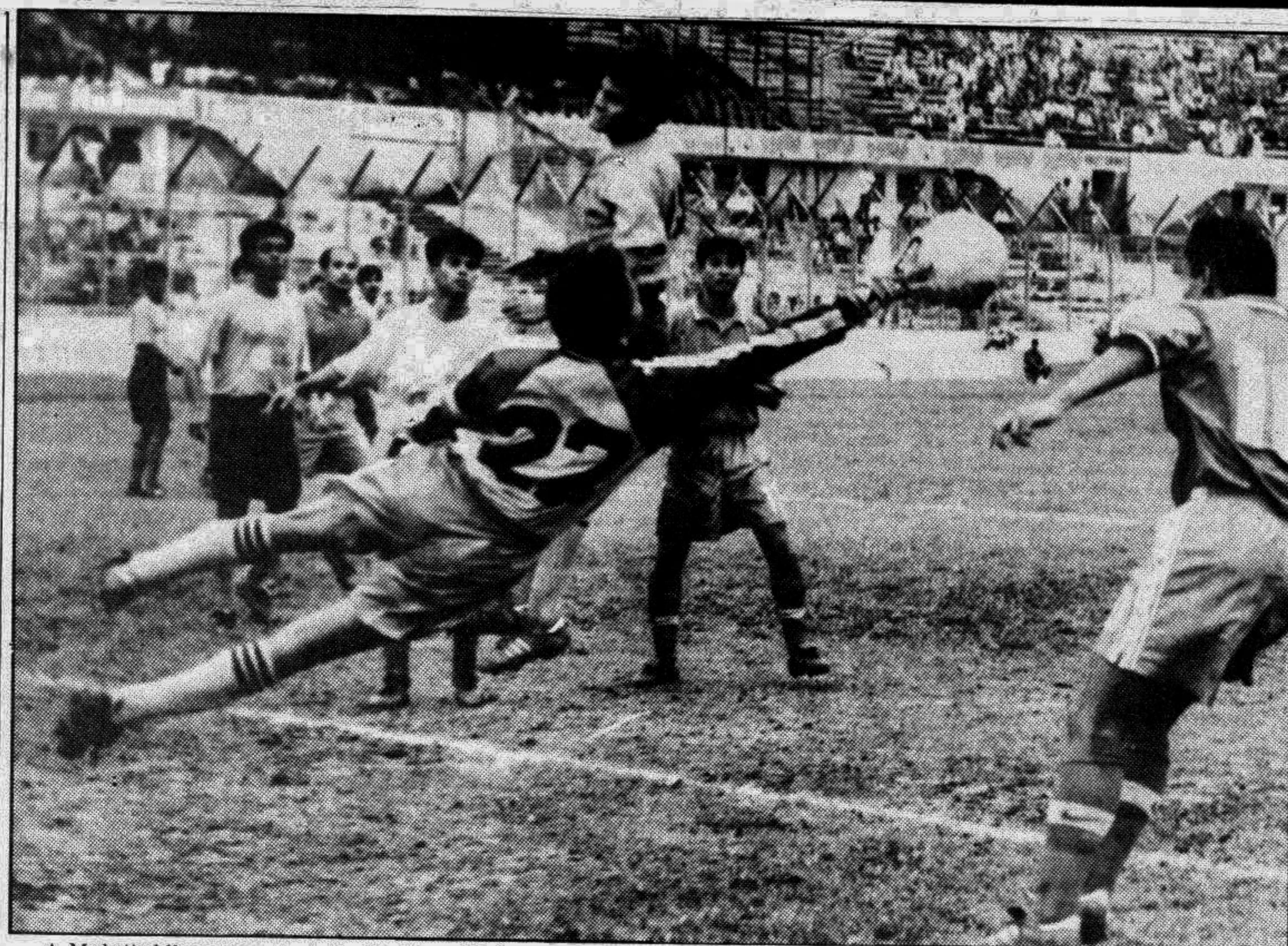
A Muktijoddha attempt at the Brothers Union post yesterday.