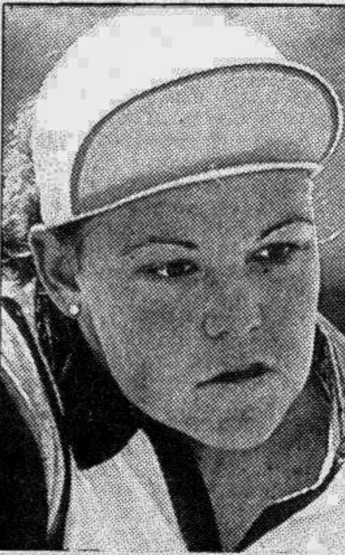
Lindsay Davenport (American tennis star)

"Getting to the final (at Wimbledon) for outshines reaching the top ranking."