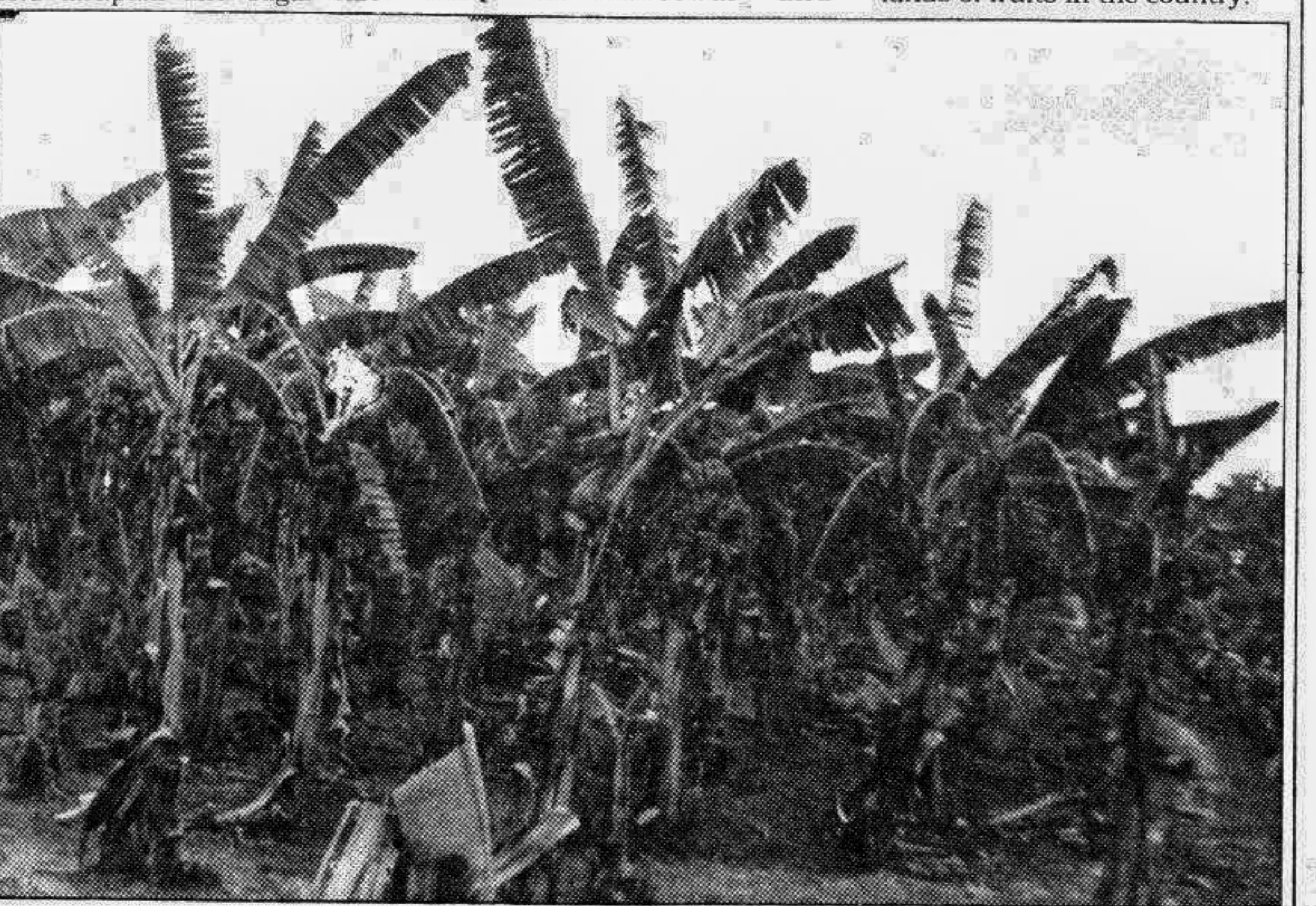
Money spinner: Banana cultivation is very popular now in Natore, as farmers are sure of a good price.

Local people have urged the authorities concerned to take steps to set up fruit processing plants in the northern districts, the main source of various kinds of fruits in the country.