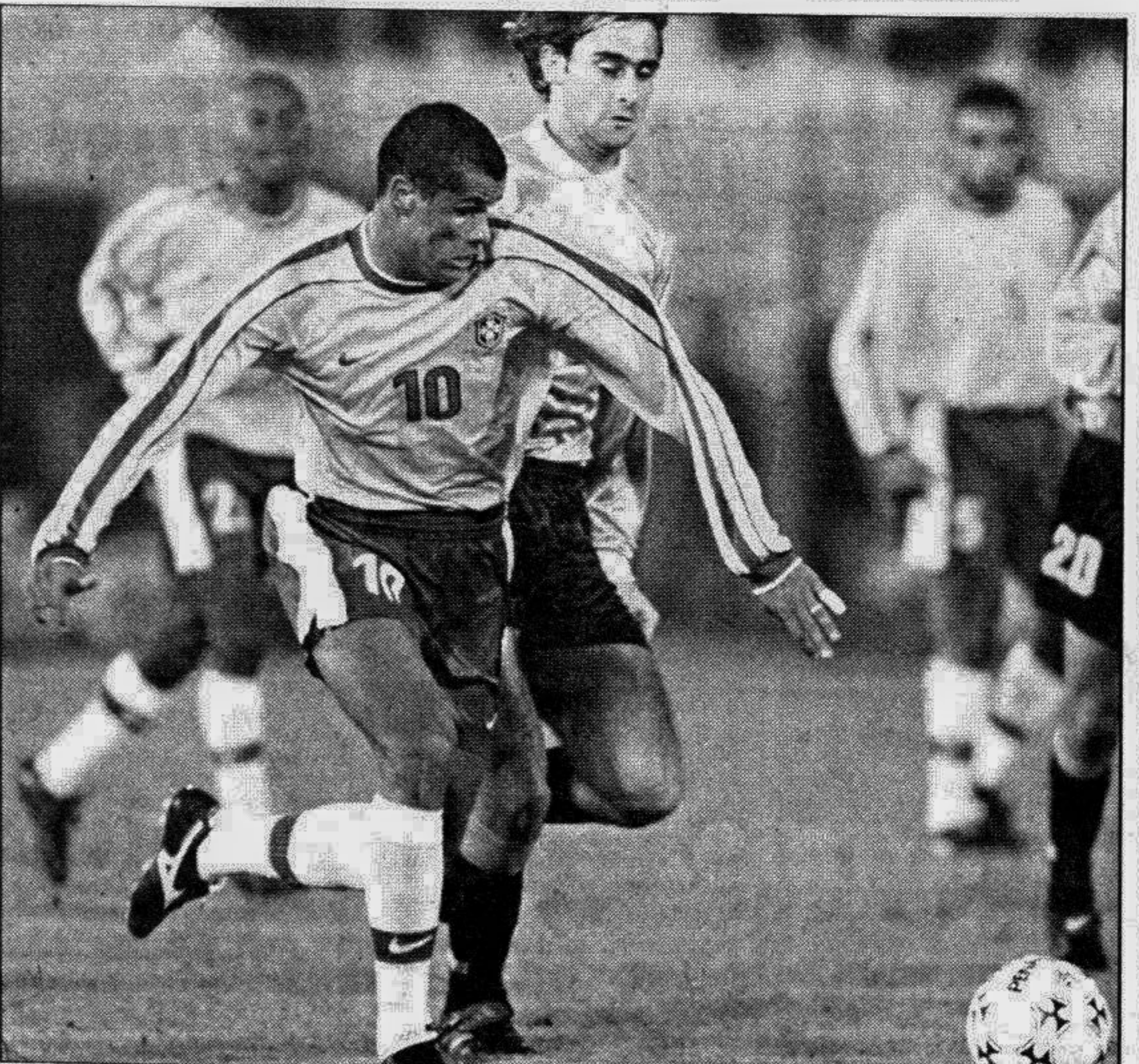
COPA AMERICA'S BEST: The outstanding Rivaldo, who was declared player-of-the-tournament, on rampage against Uruguay in the Copa America final at Asuncion on July 18.

A charred body was discovered but it was so badly burned that it was impossible even to identify what sex it was.