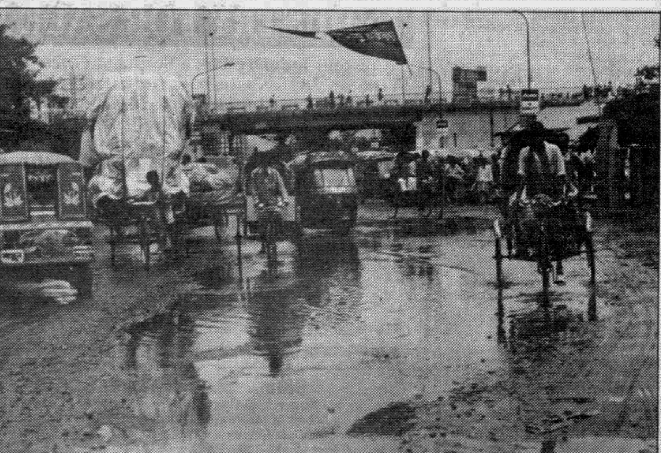
Rains have rendered the already damaged roads of Postagola in Old Dhaka almost unusable by traffic and people alike.

JP president member and former minister A B M Golam Mostafa will accompany him, says a party press release.