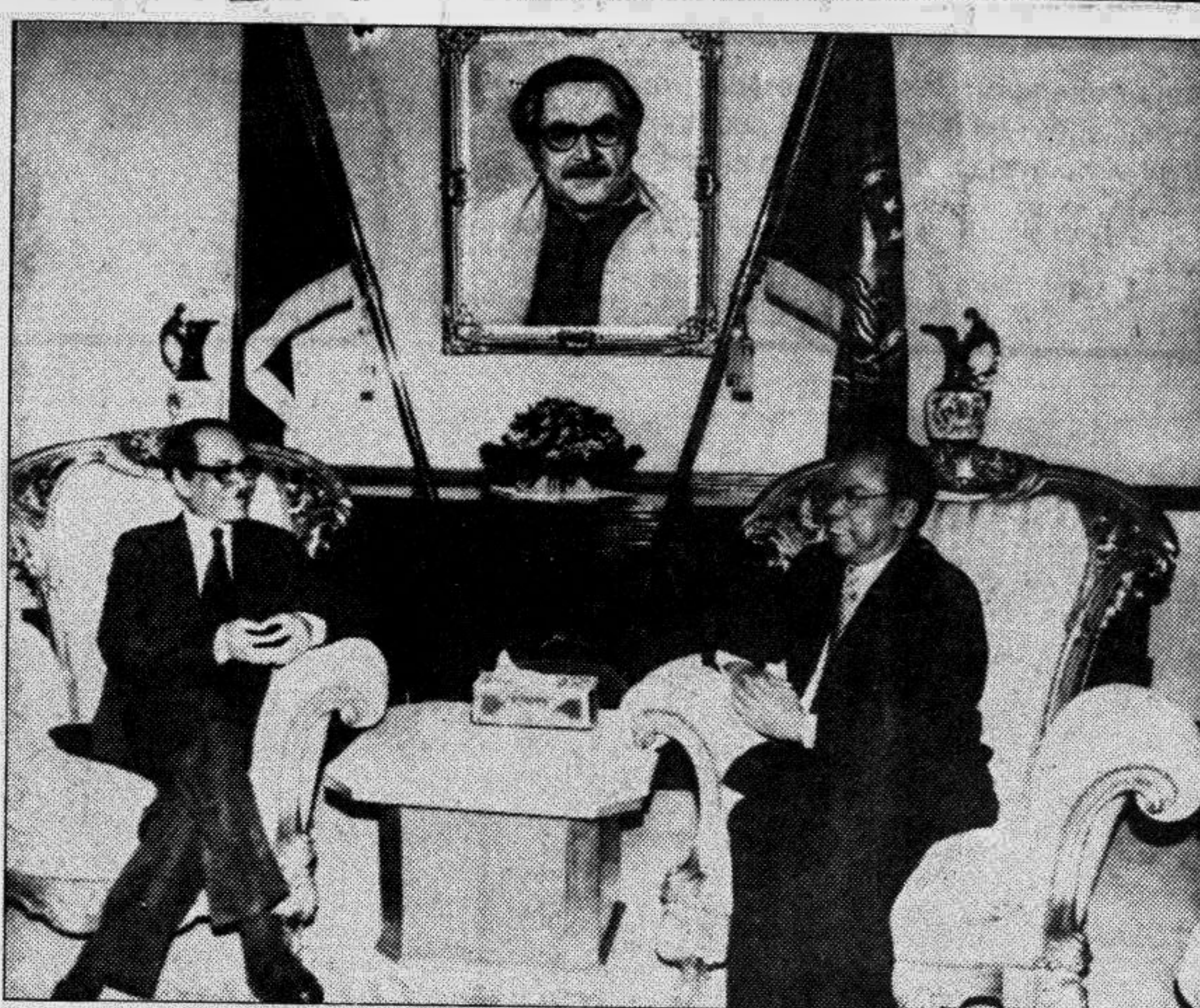
U Aung Win, Myanmar Foreign Minister, called on President Shahabuddin Ahmed at Bangabhaban yesterday.

JP president member and former minister A B M Golam Mostafa will accompany him, says a party press release.