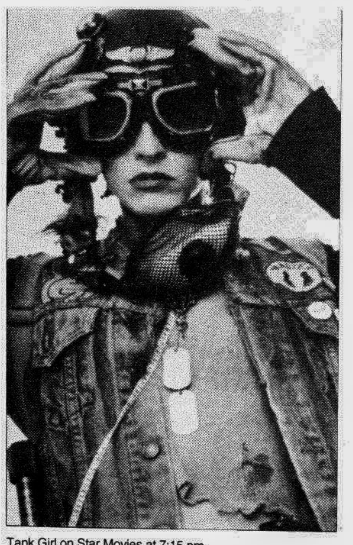
Tank Girl on Star Movies at 7:15 pm

Starring Liam Neeson, Jessica Lange, Tim Roth and John Hurt. A passionate, romantic epic, ROB ROY is the true story of Robert Roy MacGregor, a hero of 18th Century Scotland, whose love for one woman gave him honour, courage and, ultimately, his life.