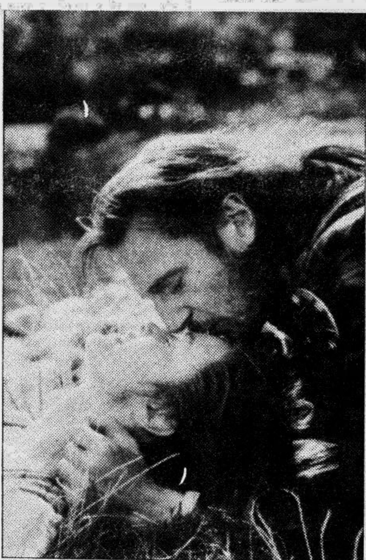
Sunday Night Premiere: Rob Roy on Star Movies at 10 pm

7:30 Aalaap 8:00 B&W Gems 8:30 All Time Hits 9:00 Hit Parade 9:30 World Premiere 9:45 Brake Fail 10:30 Hit Mix 11:00 Colgate Zig Zag Best Of The Day 11:30 Bajaj Music Box 12:00 World Premiere 12:15 Medimix Madhur Moments 12:30 Bakeman's Star Ek Mood Anek 12:55 Pop Re Pop 1:00 Jharokha 1:30 Best Of The Best 2:15 World Premiere 2:30 Double Mint Double Maaza 3:00 All Time Hits 3:30 Medimix Madhur Moments 3:45 Bakeman's Star Ek Mood Anek 4:00 World Premiere 4:15 Pop Hungama 4:30 Bajaj Music Box 5:00 Hum Ta Ra Rum 5:30 Hit Mix 6:00 Brake Fail 6:45 World Premiere 7:00 Hit Parade 7:30 Pop Buster 8:00 Bakeman's Star Ek Mood Anek 8:15 Medimix Madhur Moments 8:30 House