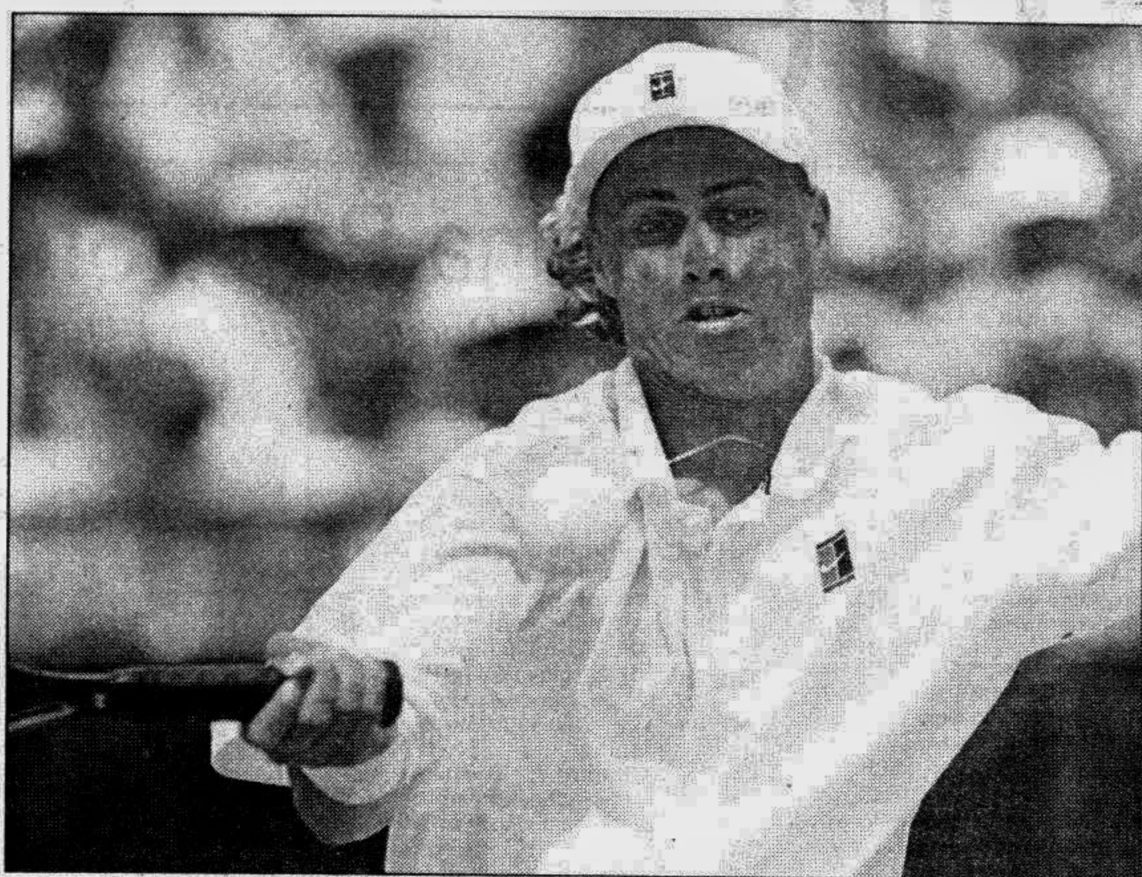
Lleyton Hewitt of Australia executing a forehand against Todd Martin of the USA during their Davis Cup fixture at Brookline on July 16.

Yugoslavia also play neighbours Macedonia on September 4 and 8.