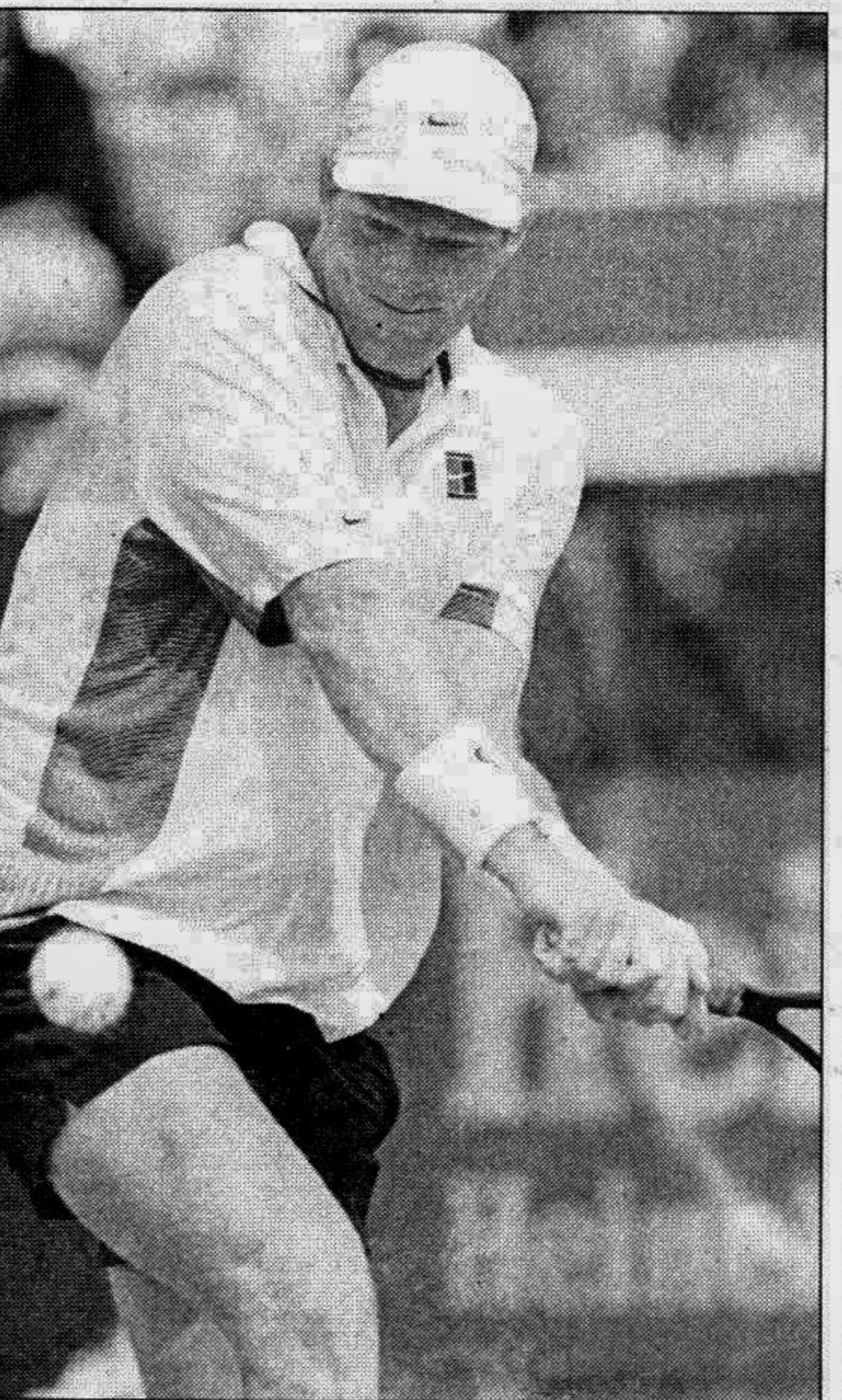
Jim Courier of the USA makes a backhand return during his Davis Cup tie against Australian Pat Rafter at Brookline on July 16.

CRYPTOQUIP J F A S Q H F A M Z X C X C B F Q H U Q S A C X Z A B J F A Q M C A U H V C M V B Yesterday's Cryptoquip: TO BE FRANK, I OFTEN JUST PREFER TO SKIP JOKES ABOUT ROPES. Today's Cryptoquip clue: M equals R The Cryptoquip is a substitution cipher in which one letter stands for another. If you think that X equals O, 45 — Angeles will equal O throughout the puzzle. Single letters, short words and words using an apostrophe give you clues to locating vowels. Solution is by trial and error.