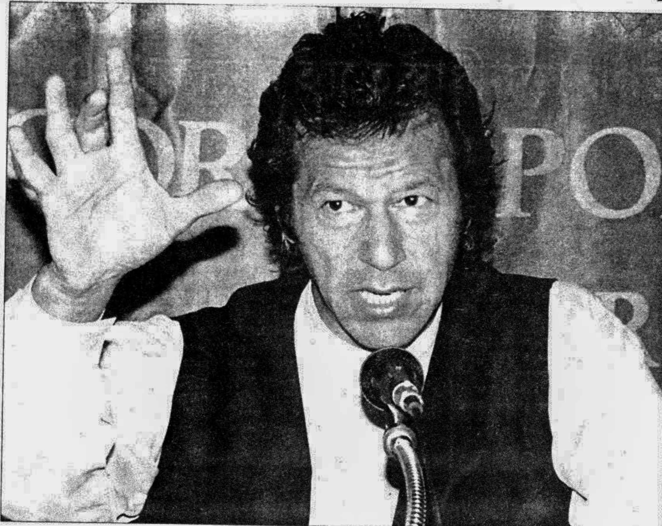
Pakistani cricket legend Imran Khan speaking at a conference of the Sri Lankan Foreign Correspondents' Association at Colombo on July 15.

Those two wins followed a 3-1 defeat at lowly Samara a week ago and have lifted Spartak on to 46 points from 20 matches - 11 clear of second placed Lokomotiv Moscow who won 4-2 at Torpedo Moscow - but Lokomotiv have four matches in hand over Spartak.