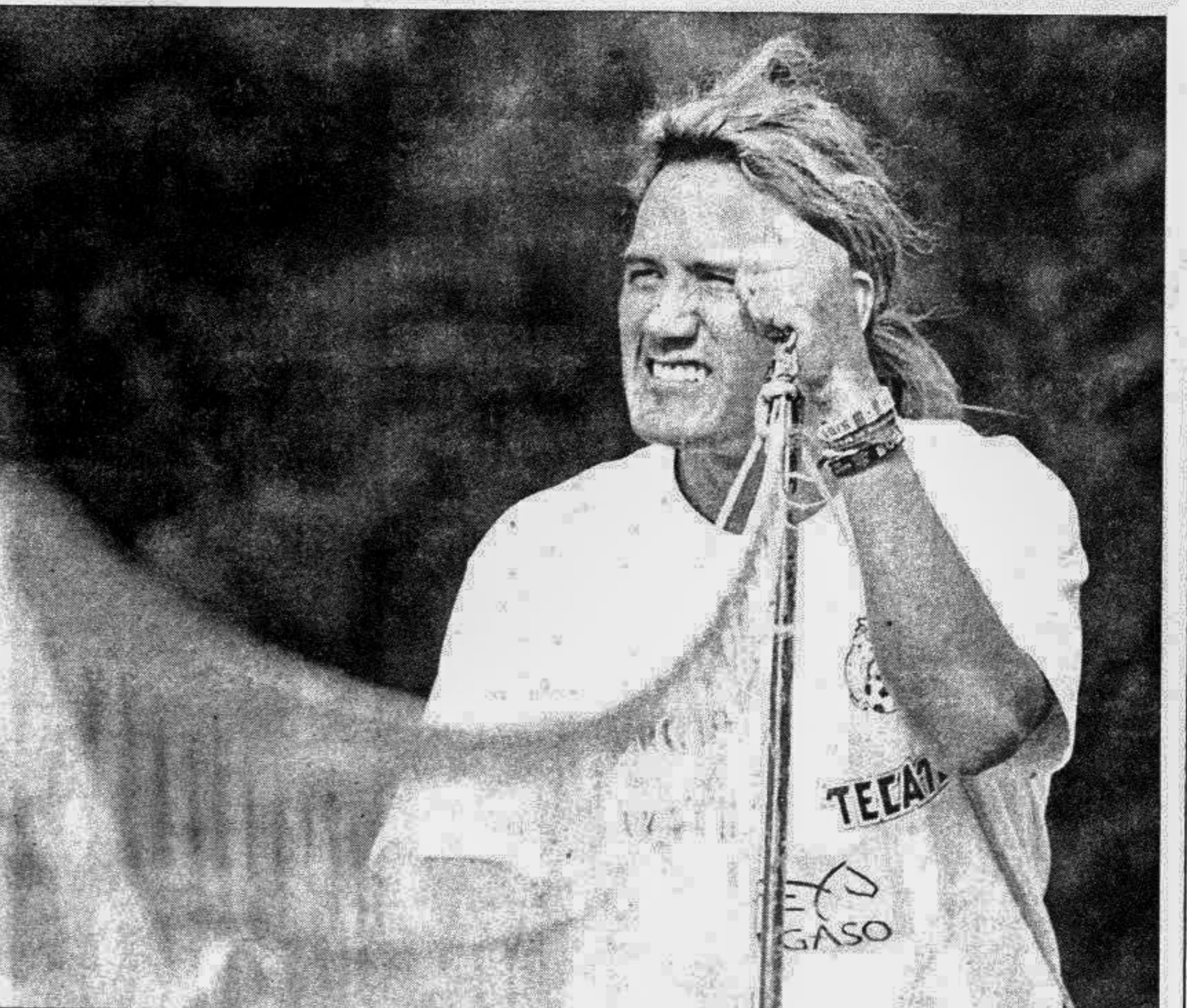
Mexican striker Luis Hernandez watching his teammates play tennis-soccer at Foz de Iguaçu, Brazil during a training session on July 14. Mexico take on Chile in the third place decider of the Copa America tonight.

Former Argentine soccer star Mario Kempes was hired last month as a coach in a bid to bail out The Strongest, which ended next to last in the local Apertura tournament disputed in the first half of the year.