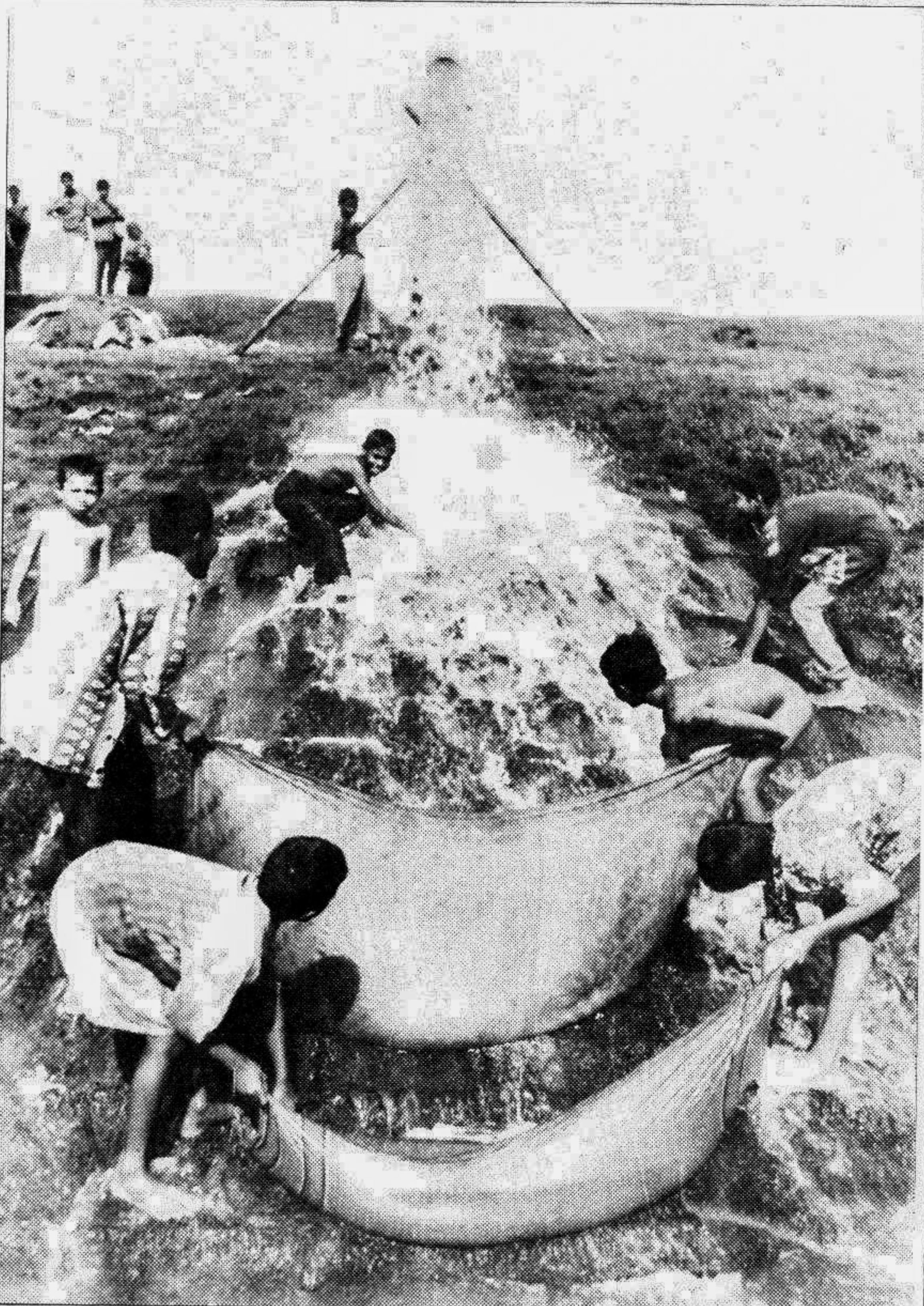
Children are catching fish in the pumped out water from inside the flood protection dam at Jahanabad, Mirpur in the city yesterday.

The 300-strong group of Chechens then took 160 hostages during a raid ending in a Russian military assault that saw most of the gunmen slip away undetected. Many remain on Russia's wanted list to this day.