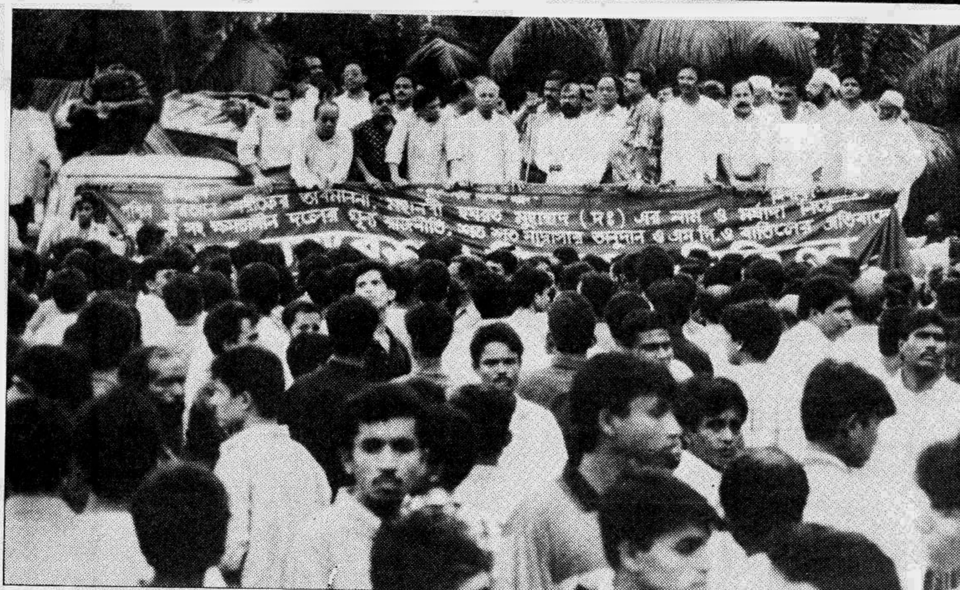
A view of the city BNP protest rally at Purana Paltan yesterday.