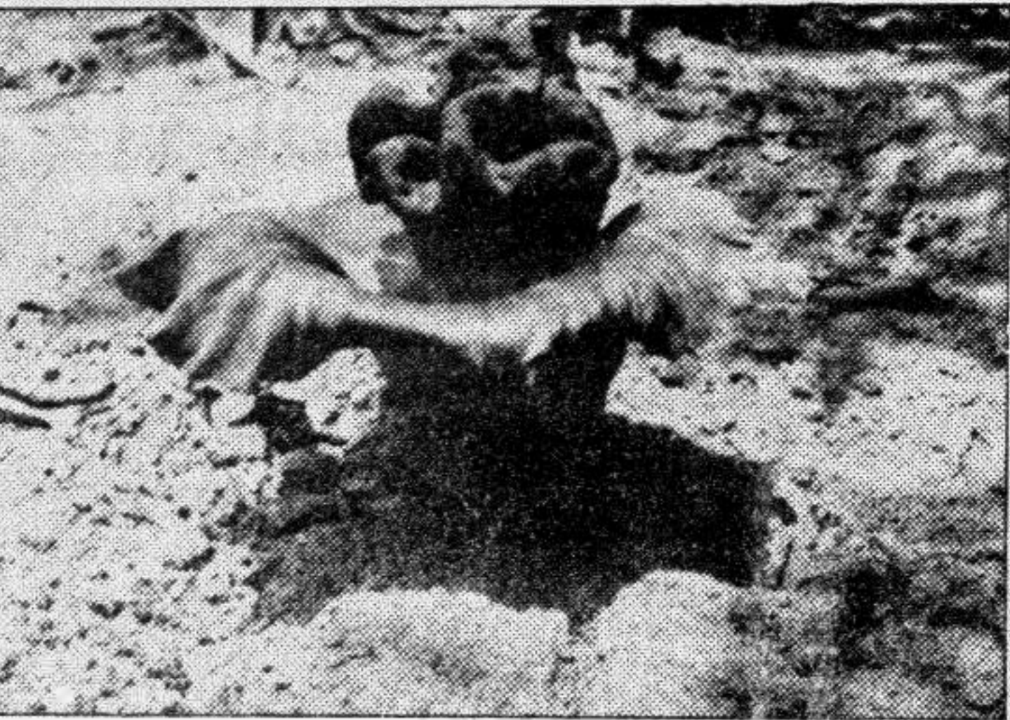
Unusual beauty: The rare arum flower grew in a crop field of Sailkupa, Jhenidah.