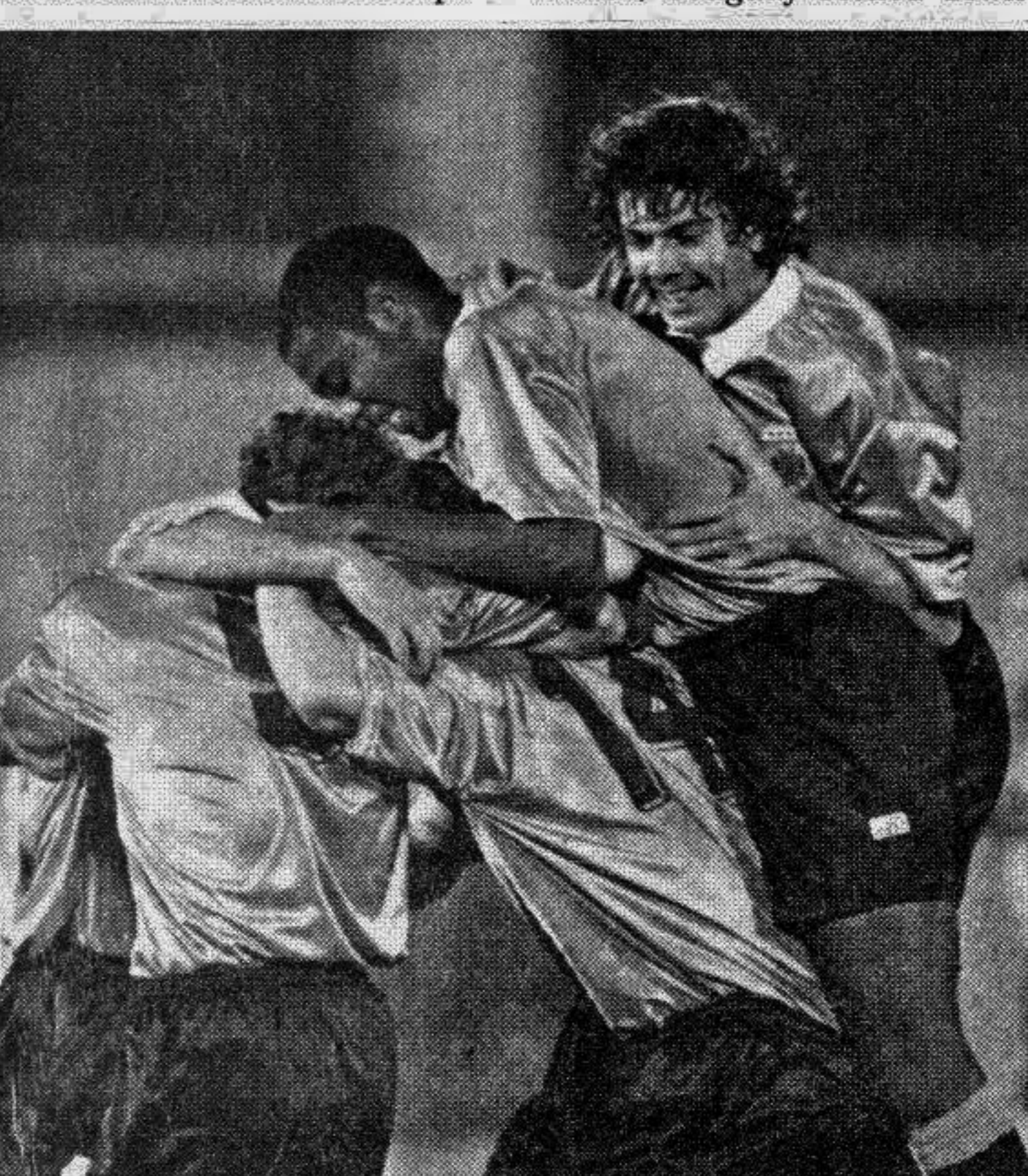
YOUTH IS GOLD: The young and inexperienced Uruguayan squad has caught the imagination of fans with their spirited display in the Copa America.

Who could help but like a team that, against heavy odds and some of the world's highest-paid stars, has pulled off upset after upset with a mix of youthful exuberance and cool composure.