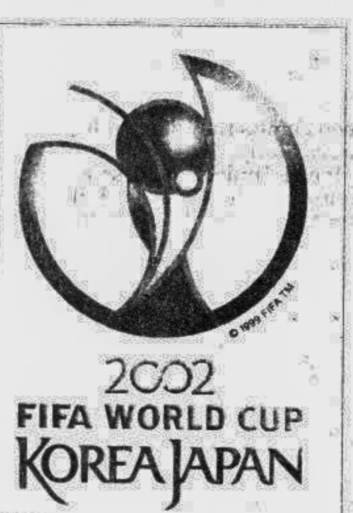
KUALA LUMPUR, July 15: Asia's hopes of capitalising on the 2002 World Cup to promote football in the region may suffer if the region's threat of a boycott becomes a reality, an Asian Football Confederation official warned Thursday, reports AFP.

The promotion of football on the continent may suffer if the threat of boycott of the tournament goes through," he told AFP on condition of anonymity.