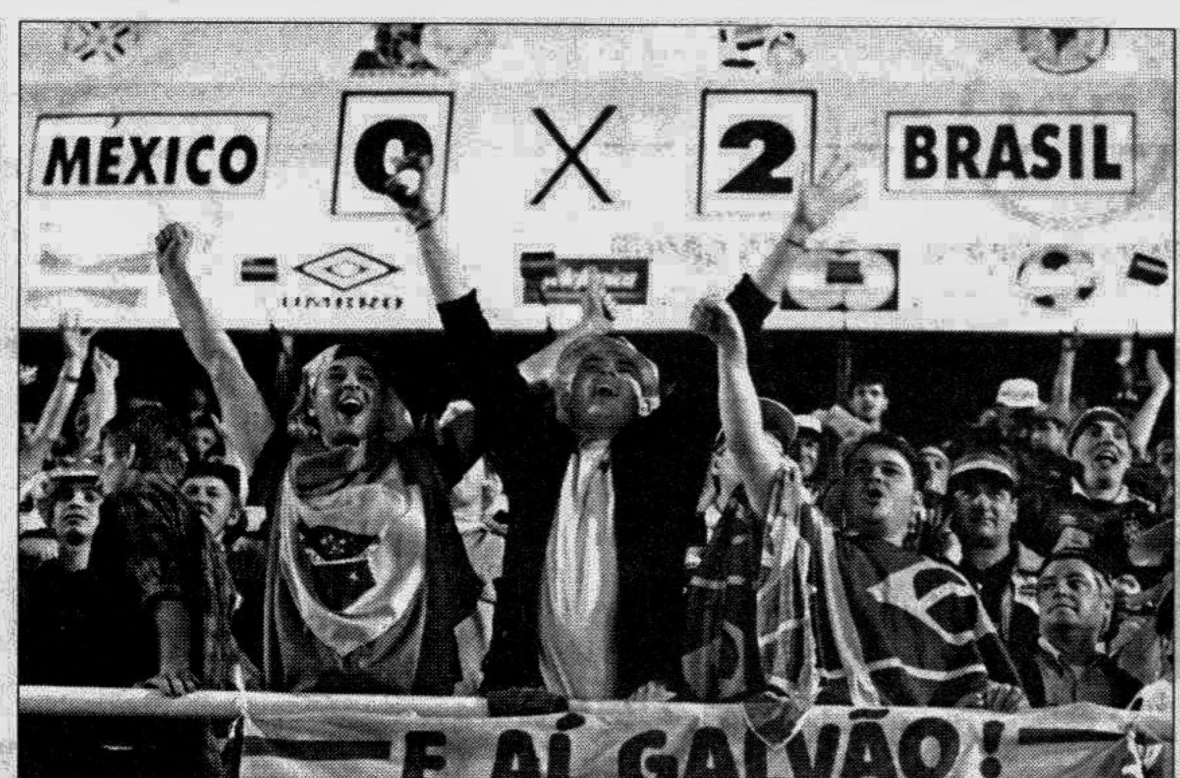
VIVA BRASIL: Brazilian fans at Ciudad del Este show their appreciation for their team's performance against Mexico on July 14.

New Zealand were due to host the West Indies for a Test and one-day series and Speed suggested they could join Australia and either Pakistan or India in a four-nation one-day tournament.