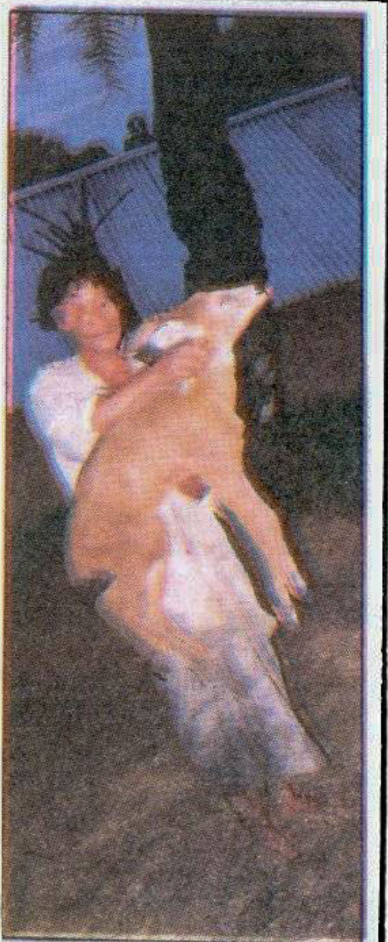
Red Serow, the rare goat seen at Matiranga.