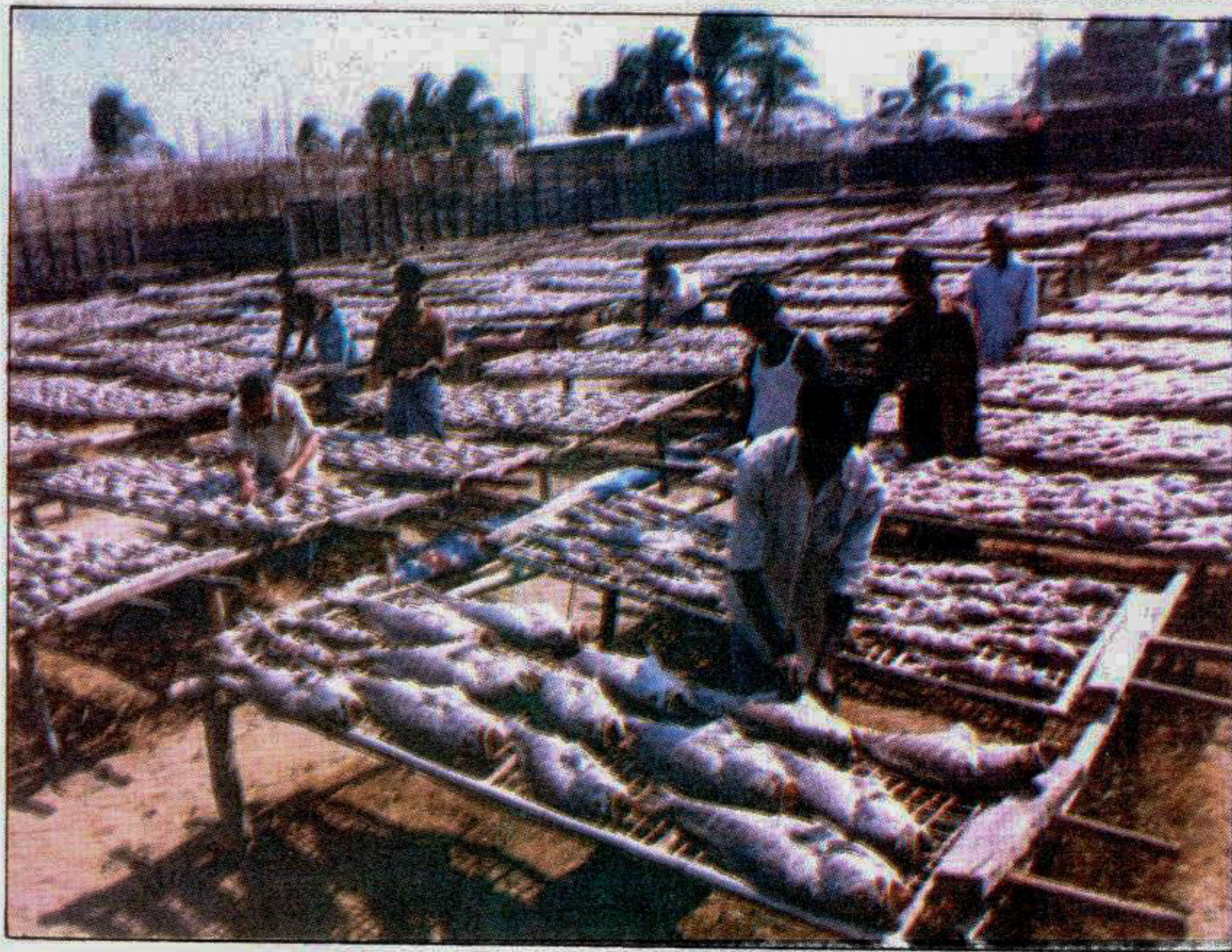
Fish being dried at Cox's Bazar.