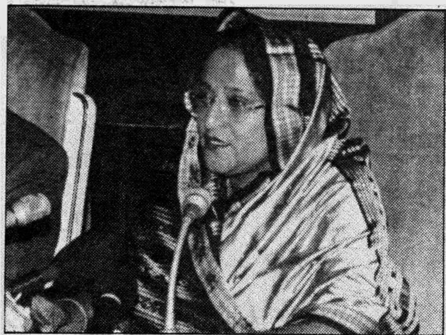
Prime Minister Sheikh Hasina talking to newsmen on her return home from the United Kingdom.

Responding to a question if her government would investigate irregularities in plot allotment under the past government, she said,