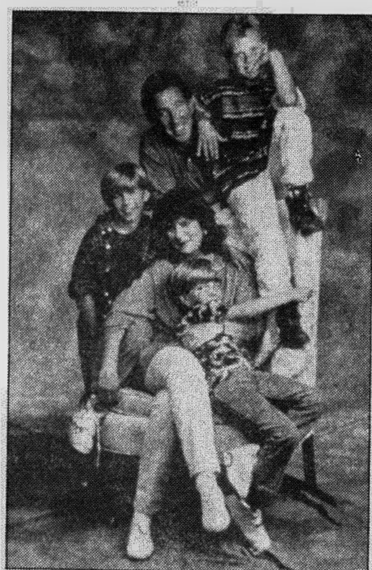
Home Improvement on Star World at 5:30 pm

6:30 Nainaad 7:30 Good Morning India 9:15 The Trial Show 9:30 Shotgun Shoot 10:00 Good Morning India-Rpt 12:00 Picture This 12:30 Zabaan Sambhalke 1:00 Film Based Frog-Hit Ya Fit 1:30 Virasat 2:00 Hindi Serial: Aur Phir Din 2:30 Daily Shoppe: Swabhimani 3:00 Say Cheese 3:30 Kabhi Kabhi 4:00 Kahini Me Twist 4:00 Story Teller 5:00 Doogie Howser MD 5:30 The Wonder Years 6:00 Small Wonder 6:30 Zabaan Sambhalke 7:00 Film Based Frog-Hit Ya Fit 7:25 The Trailer Show 7:30 Star News (Hindi) 8:00 Zindagi Com 8:30 Duniya Ki Sitare 9:00 Ajeeb Dastan 9:30 Star-