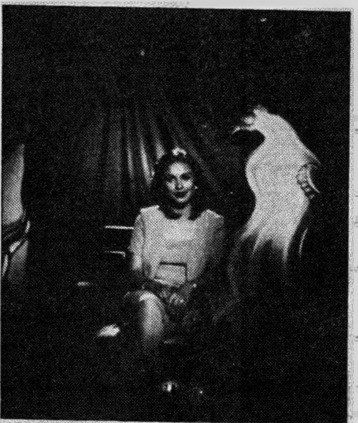
Moneywise on BBC World at 10:30 pm

6:30 Hollywood Squares 7:00 Hawaii Cooks 7:30 Animal Adventure 8:00 2 Point 4 Children 8:30 Newhart 9:00 Buffy The Vampire 10:00 Alley McBeal 11:00 The Oprah Winfrey Show 12:00 The Practice 1:00 The Bold And The Beautiful 1:30 Tropical Heat 2:30 Media TV 3:00 Animal Adventure 3:30 2 Point 4 Children 4:00 Hollywood Squares 4:30 Sky World News 5:00 Asia News Update 5:05 Fox World Business Report 5:30 Home Improvement 6:00 Series: Riality TV World's Most Chandi 10:05 Serial 10:30 Walker Texas Ranger 8:00 Thieftakers 9:30 The Bold And The Beautiful 10:00 Series: Riality TV World's Most-Why Plane Goes Down 11:00 Walker Texas Ranger 12:00 Thieftakers 1:00 The Bold And