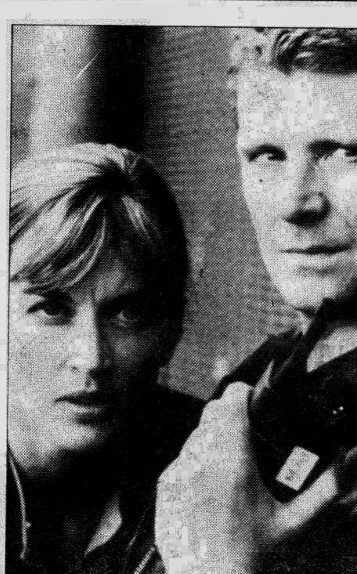
Thieftakers on Star World at 8 pm

6:00 Yeelon Ki Pal (B/W Songs Show) 6:30 Zee News & Business 7:00 Bhakti Songs 7:30 Jagran 8:00 Guldasta 8:30 Disney Hour Cartoons 9:30 Zara Has Ke- Hai Zindegi 10:00 Zara Has Ke- Filmi Chakkar 10:30 Ek Nazar 11:00 Yehi Hai Zindegi 11:30 Raahin 12:00 Naya Zamana 12:30 Suniye Zee... 1:00 Hudd Kar Di 1:30 Naye Nazrane 2:00 Hum Paanch 2:30 Chingaree 3:00 Raahat 3:30 Cinema Hits- HF Film: Gateway of India (Madhubala, Bhart Bhushan) 8:30 Ek Nazar 7:00 Disney Hour Cartoons 8:00 Bajaj Super 7:00 Muqabla (Coun Down Show) 8:30 Choti Muqabla 9:00 Amanat 9:30 X-Zone Ep-51 10:30 Jaan 11:00 Jeena Isika Naam Hai 11:30 Raahat 11:55 Jhalak-Trailor 12:00 Action Explosion Movie: Dushman Devta