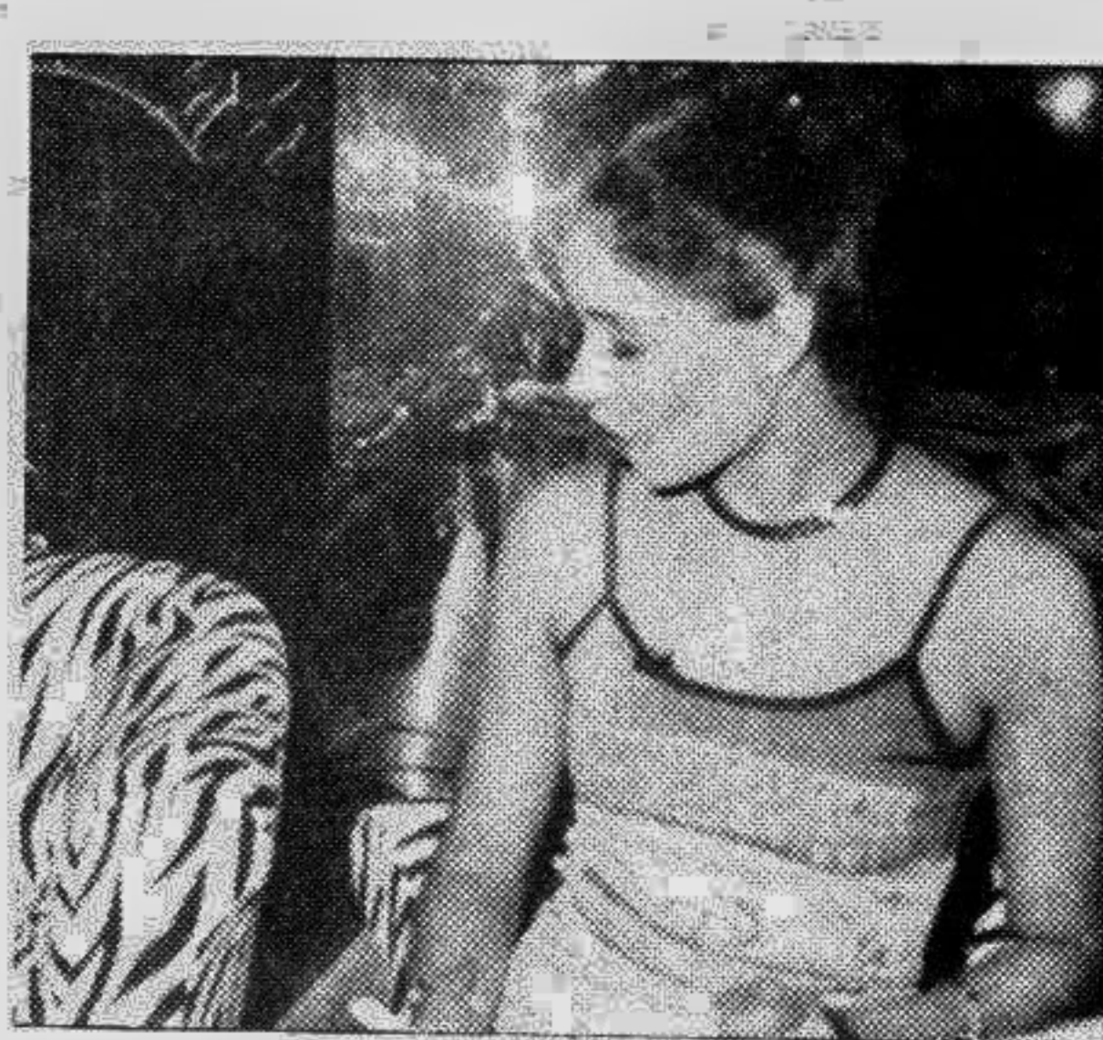
Kinetic Mega Show on Star Plus at 10 pm

10:30 Janmadin (Birth-day Greetings) 10:35