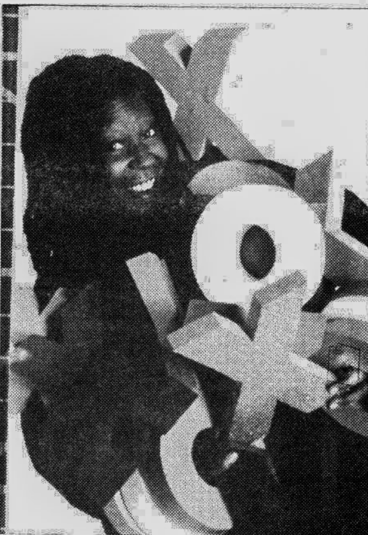
Hollywood Squares on Star World at 6:30 am

Shree Ram Krishna 11:00 Dropadi 11:15 Classical/ Folk Songs 11:30 Parliament Hour/Musical 12:30 Daily Sope: Kunja Villa 1:00 Daily Sope: Aakash Chhoa 1:30 Daily Sope: Rupkatha 2:00 Kanakanjali 2:30 Shree Ram Krishna 3:00 Maha Prabhu 3:30 Mohini 4:00 Bahadragar Khela 4:20 Rabindra Sangeet 5:05