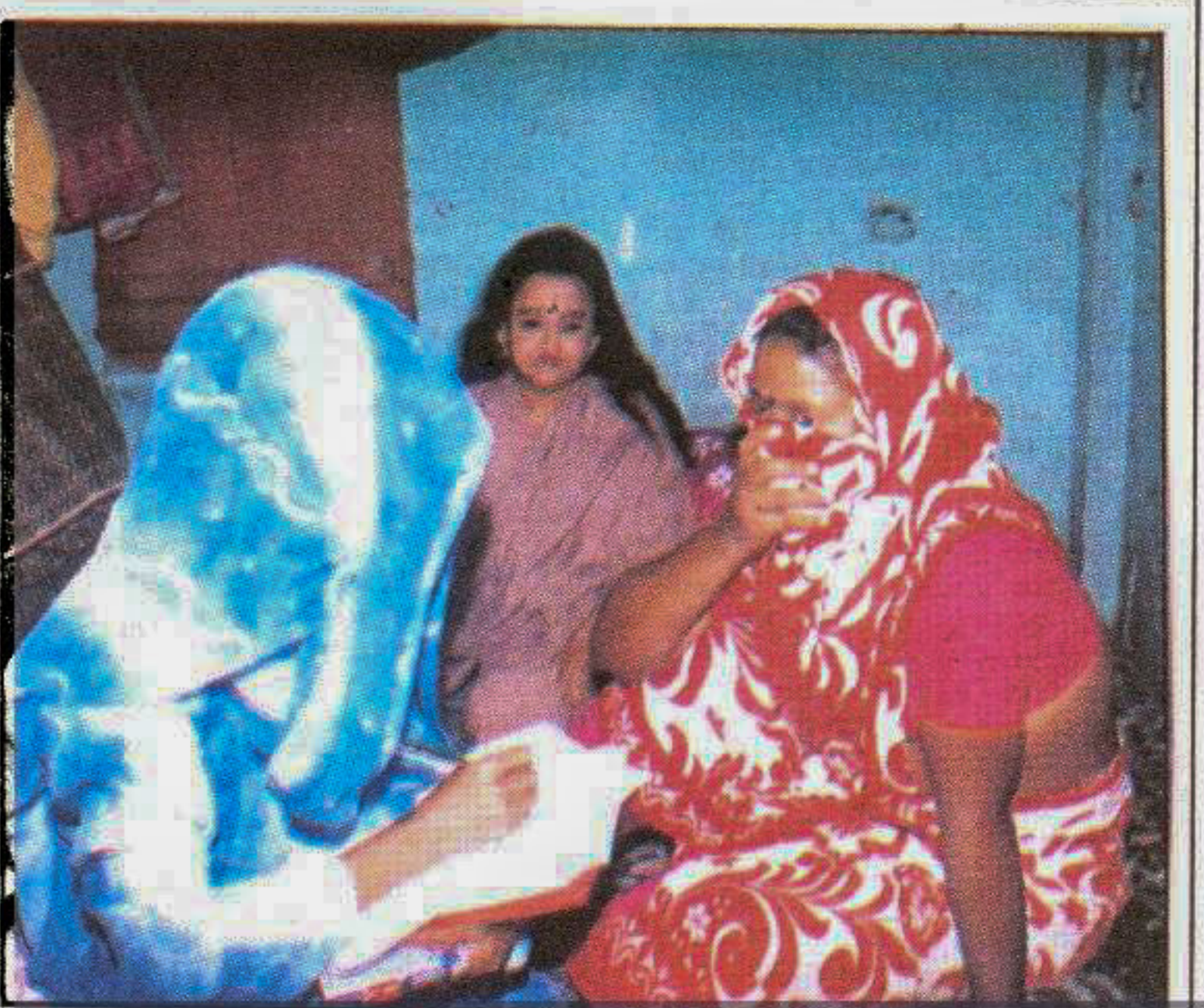
Brutal destiny Sex worker filling up form at Tanbazar, Narayanganj, yesterday.

They demanded withdrawal of the false cases and formation of judicial committee to inquire into the incident.