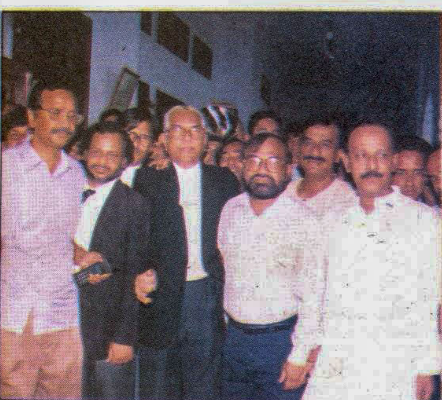
Travails of politics BNP leader Sadek Hossain Khoka coming out of court, yesterday.