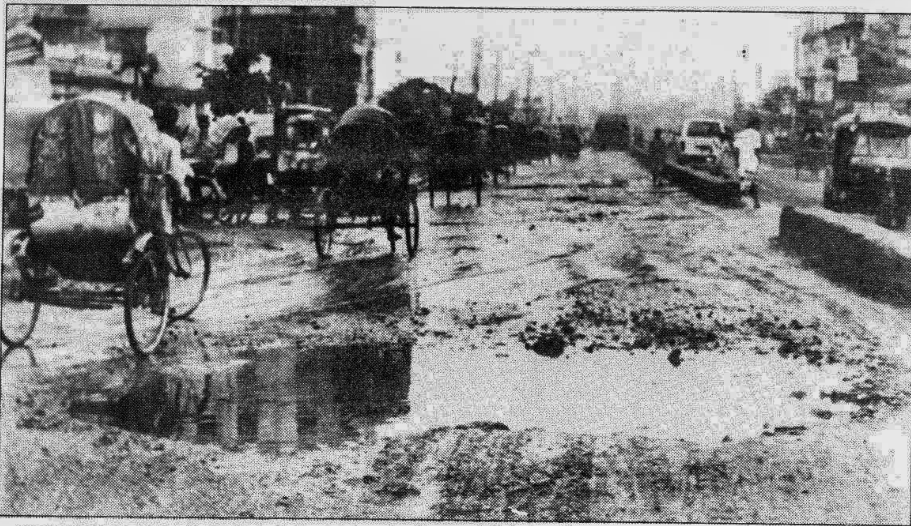
The rains have added to problem of damaged roads all around the city. The above picture showing pools of water on such a road was taken from city's Baridhara area.