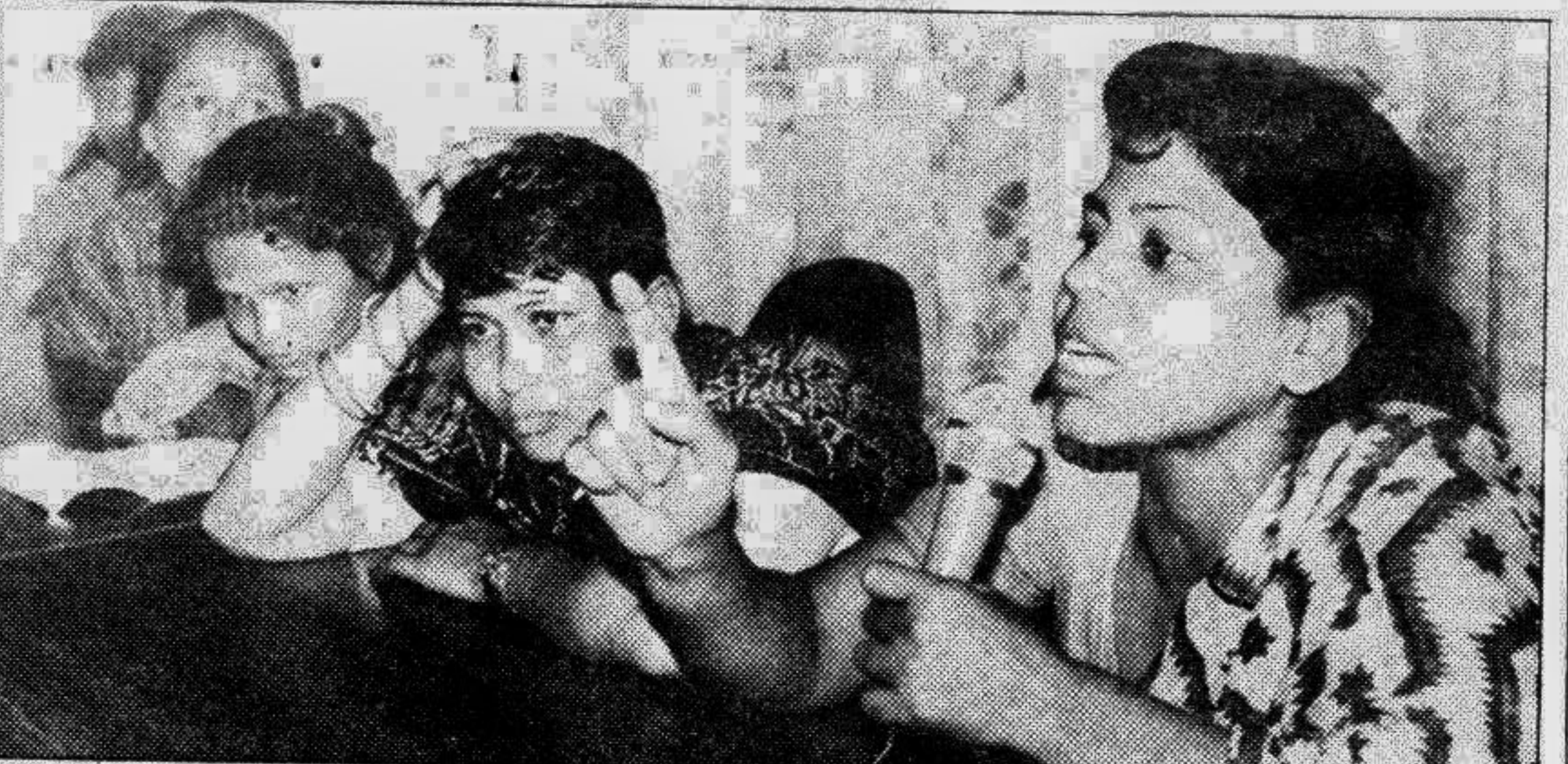
Sex workers of Tanbazar and Nimtali held a press conference at the CIRDAP auditorium in the city yesterday protesting their eviction from the red-light area.

"Only Allah can punish us for our sins after we die, no one else can do so. We have every right to burial after death," she said.