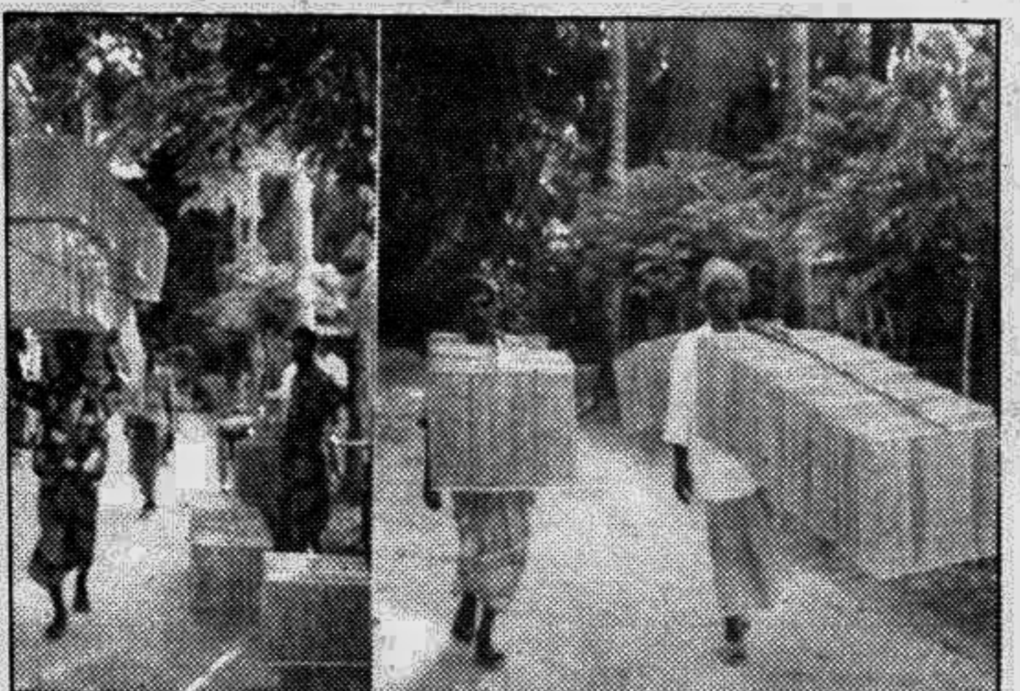
New trap: Ghunirs have flooded the markets of Magura. It is very popular for catching fish-fries in the rainy season.

MEHERPUR, July 14: The Detective Branch of police arrested one person and seized 45 bottles of phensidyl from his possession from Motpara area of the town, police said, reports BSS. Acting on a tip-off the Detective Police raided a house in the area and arrested Moslem with contraband phensidyl syrup.