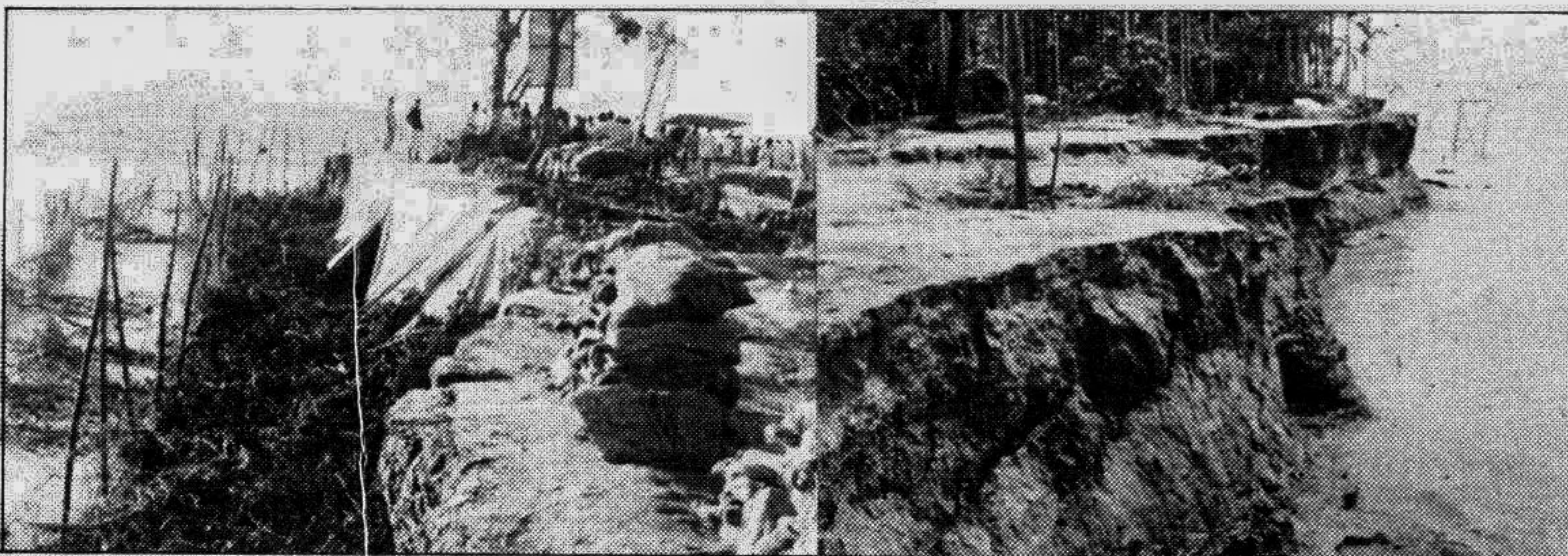
Meghna's toll: Erosion at Akhener hat, Haimchar, Chandpur continues unabated. Bamboo, twigs, bricks and textiles are being used in an effort to contain the onslaught (left).

CHANDPUR, July 14: Erosion of the river Meghna has threatened the existence of Taka 100-crore Chandpur Irrigation Project (CIP) at Haimchar thana.