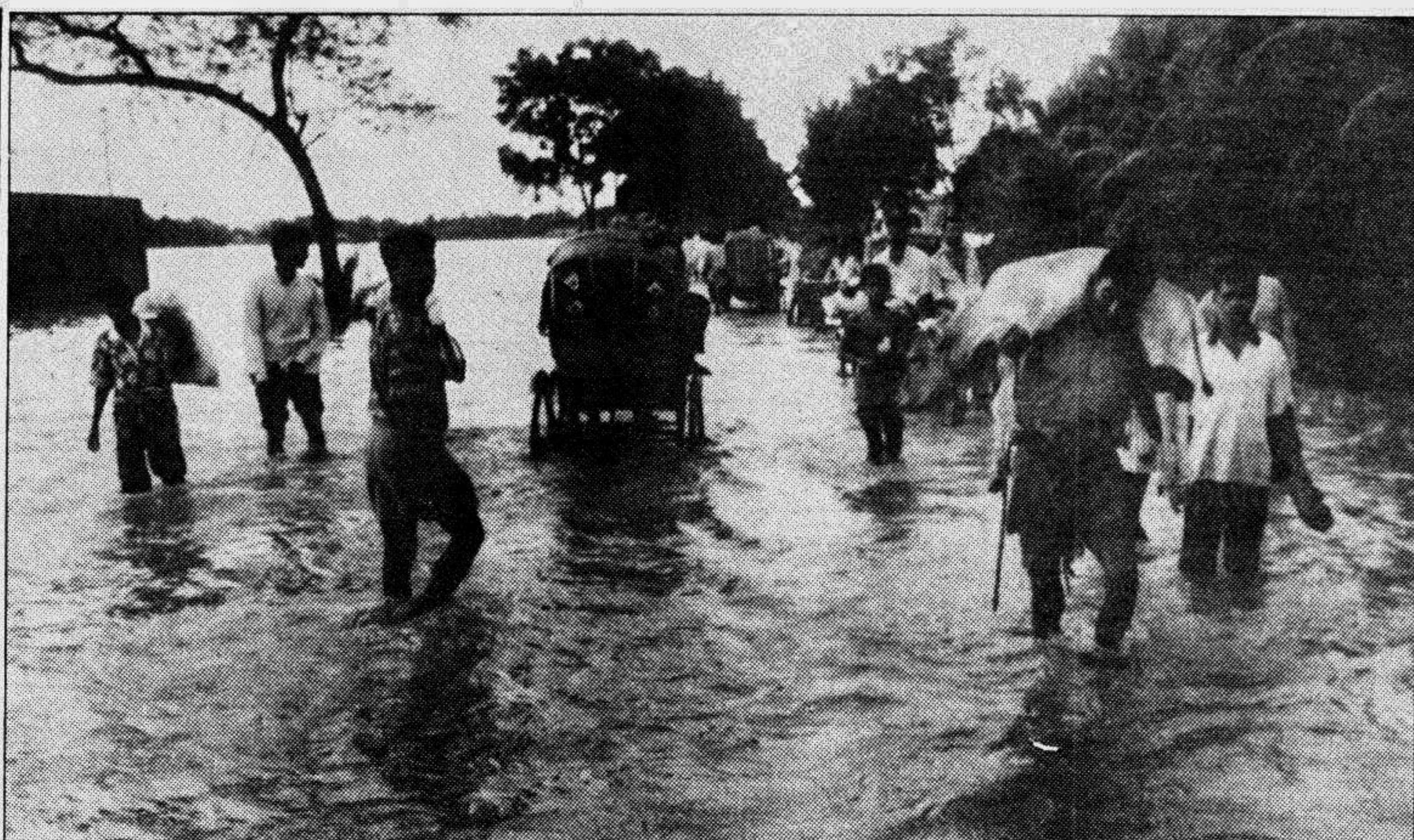
Trek to safety