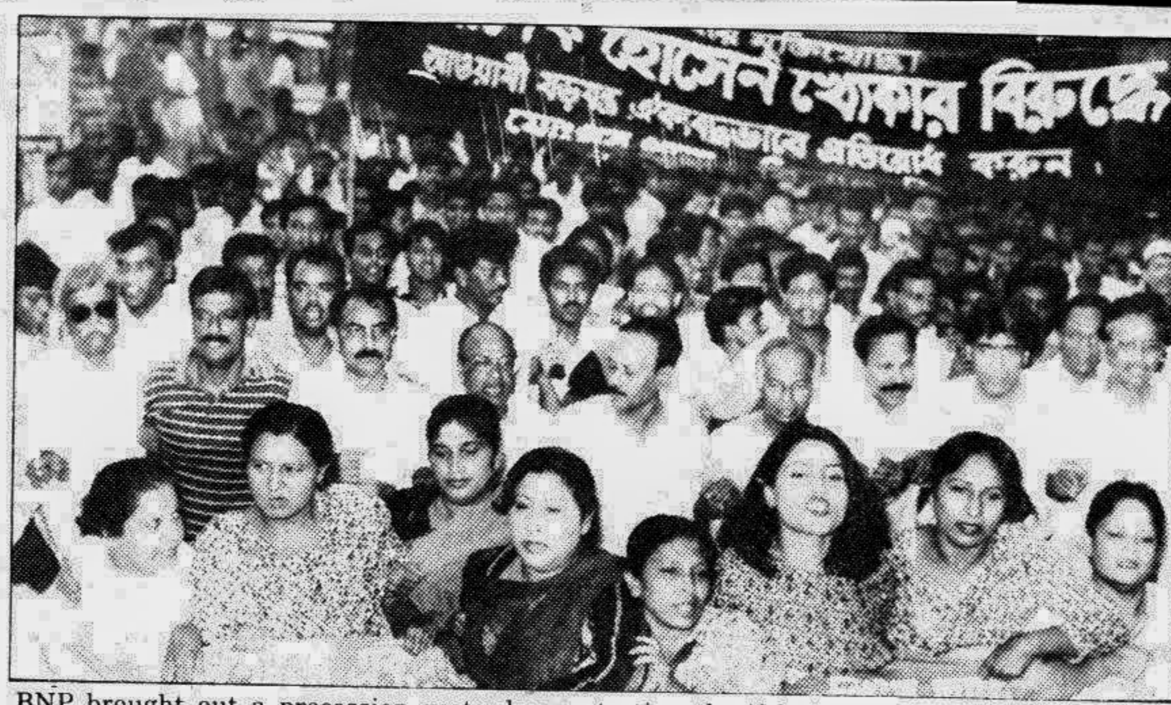
BNP brought out a procession yesterday protesting the 'false' cases filed against Sadek Hossain Khoka MP and several other party activist.

The government is now evicting inhabitants of Barabara to give more plots to Awami League leaders, he claimed. He demanded immediate cancellation of the allotments for re-distribution of the plots and stoppage of the eviction.