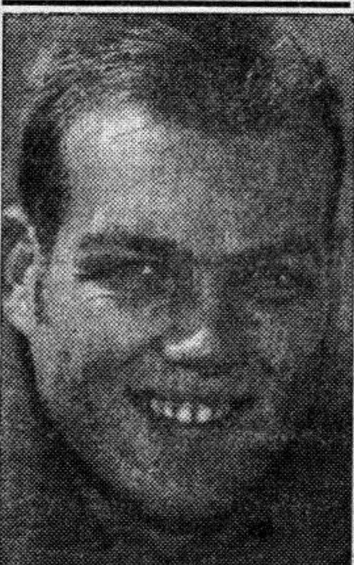
Jacques Kallis (South African all-rounder) I regard myself as a batter who bowls a bit.