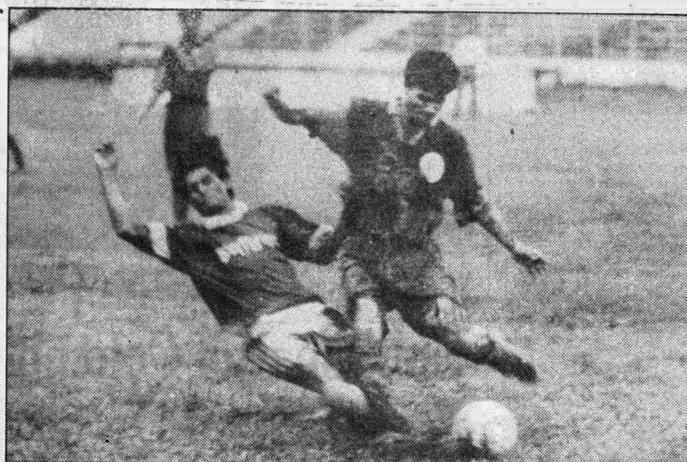
Action from yesterday's Premier Division soccer league match between Brothers Union and Mirpur Chalanika at the Bangabandhu National Stadium.