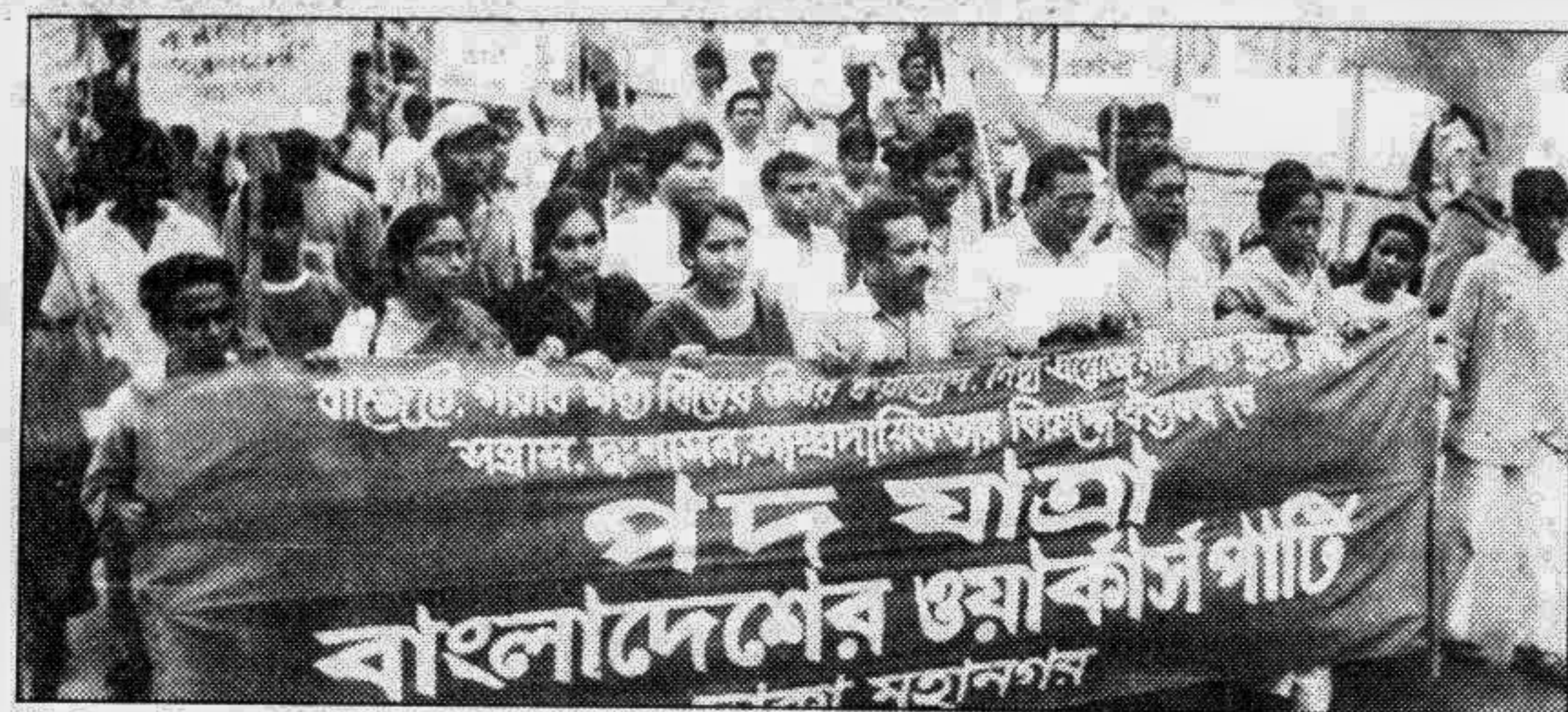
Workers Party brought out a procession in the city yesterday protesting rise in the price of essentials and the anti-people budget.