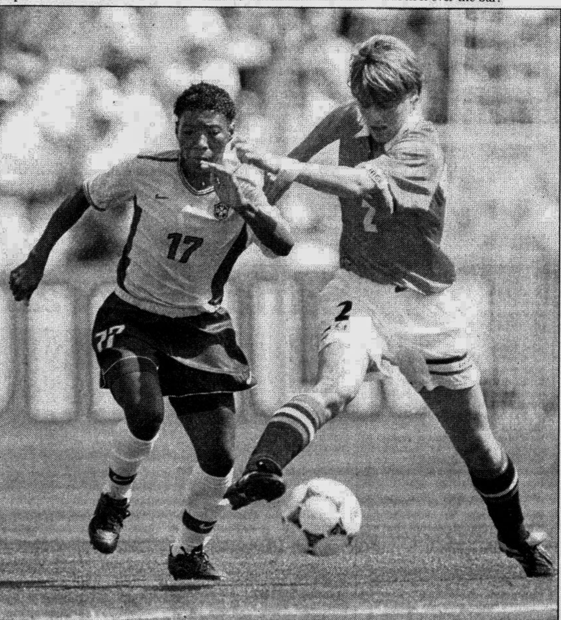
Action from the Brazil-Norway Women's World Cup third place decider at the Rose Bowl on July 10.