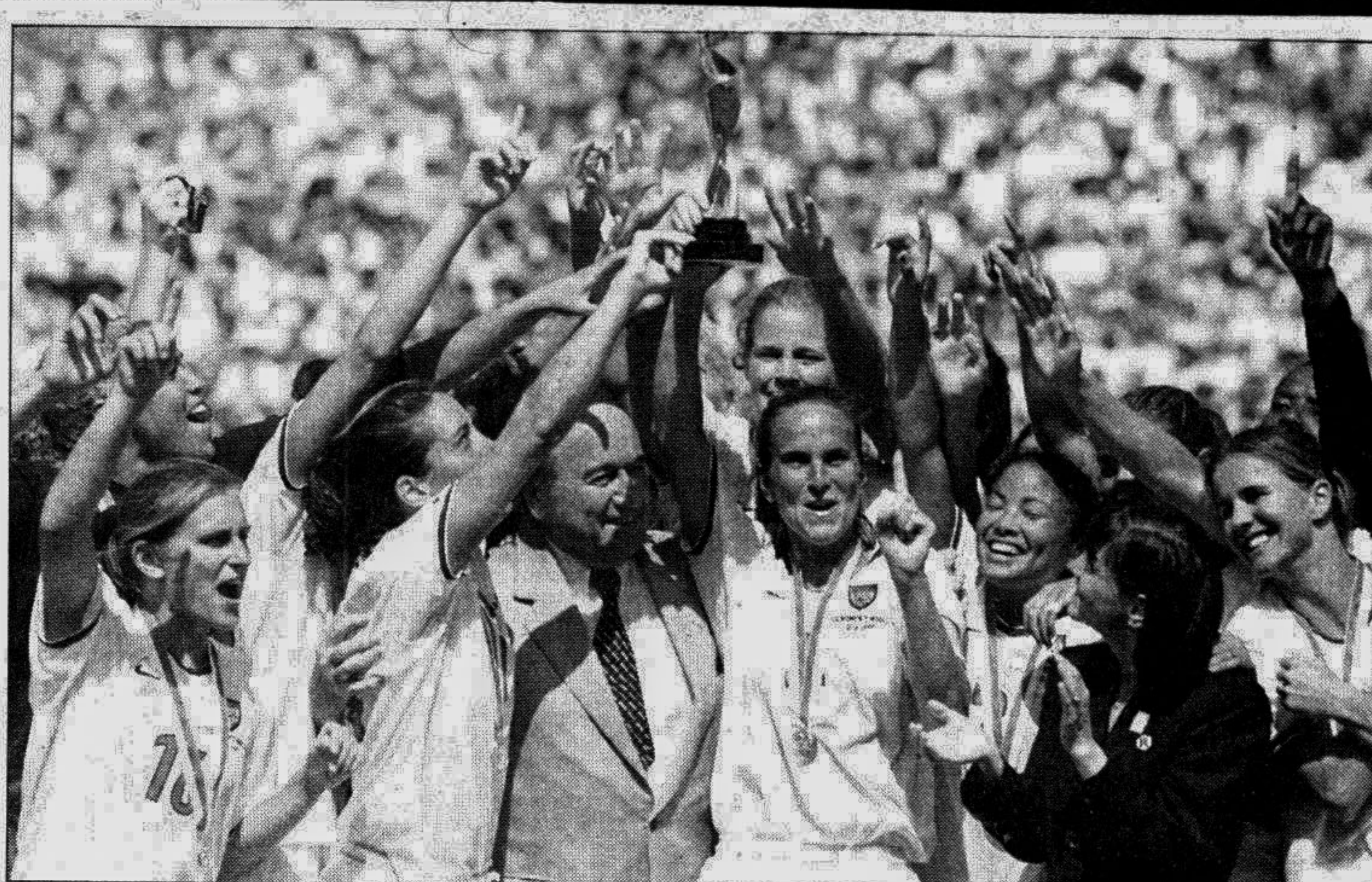
WE ARE THE CHAMPIONS: FIFA president Sepp Blatter(C) joins the US celebrations after handing over the Women's World Cup at Pasadena Rose Bowl on July 10.