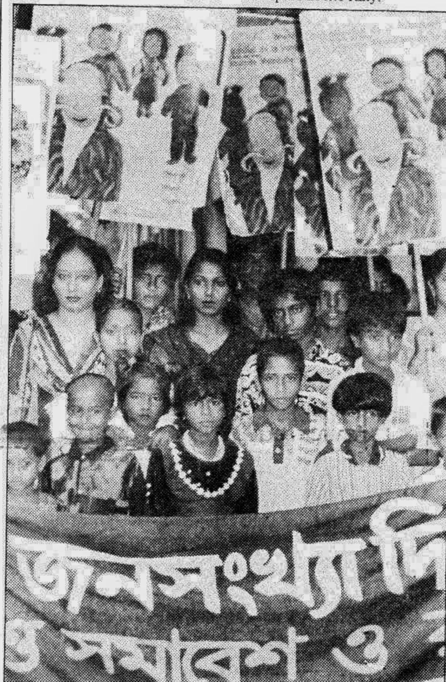
Amra Kuri, a children's organization brought out a colourful rally in the city yesterday marking World Population Day.