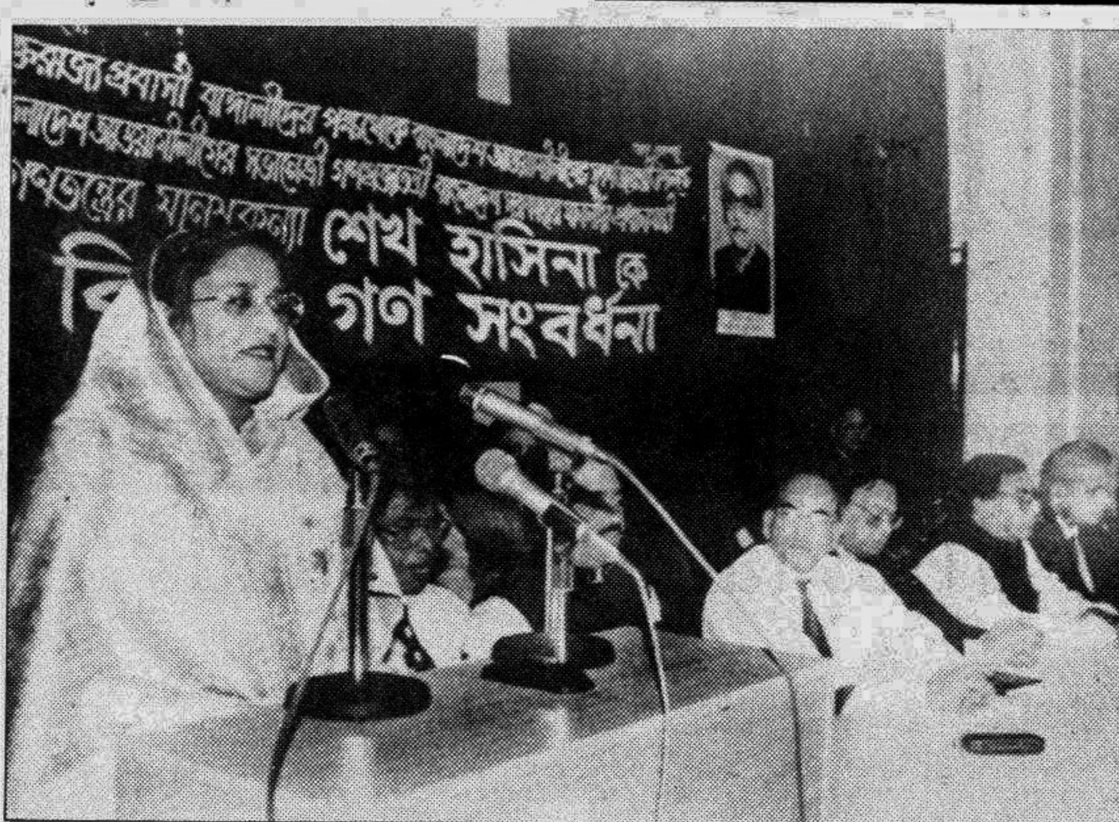
Prime Minister Sheikh Hasina was accorded a reception by Bangladeshi expatriates in UK at the York Hall yesterday.

The body of the deceased was buried at Azimpur Graveyard after Zohr prayers yesterday.