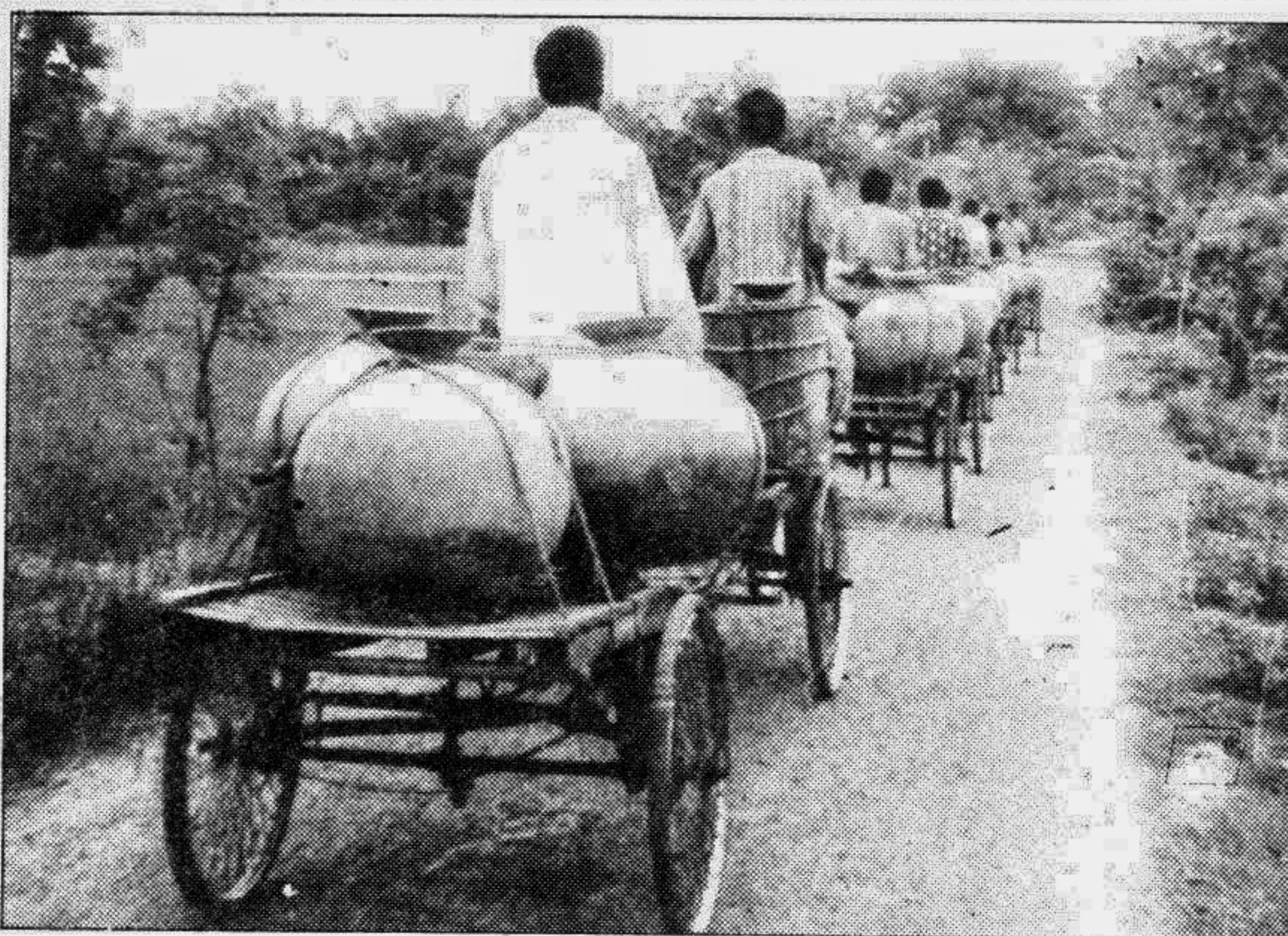
Now is the time of a fast changing society. The mode of carrying goods from far flung areas of rural Bangladesh has also changed. Previously bullock carts were the only means of carrying various necessary items from here and there. But the days are gone. Now rickshaw vans are the main means of transporting goods in village areas. In many places 'Nasiman', autorickshaws run by shallow machines are also used. This is because almost all the roads in rural areas have become pucca. The picture above was taken from Sailkupa-Kancherkole road in Jhenidah district recently where rickshaw van pullers plying their vans in a queue.

It may be noted that a total of 410 person had been killed by the armed miscreants and terrorists in all the four thanas during the last eight years from 1991 to 1998. Of the total killings 51 persons were killed in 1991, 49 persons in 1992, 52, person in 1993, 50 persons in 1994, 51 person in 1995, 49 person in 1996, 31 persons in 1997 and 77 persons in 1998.