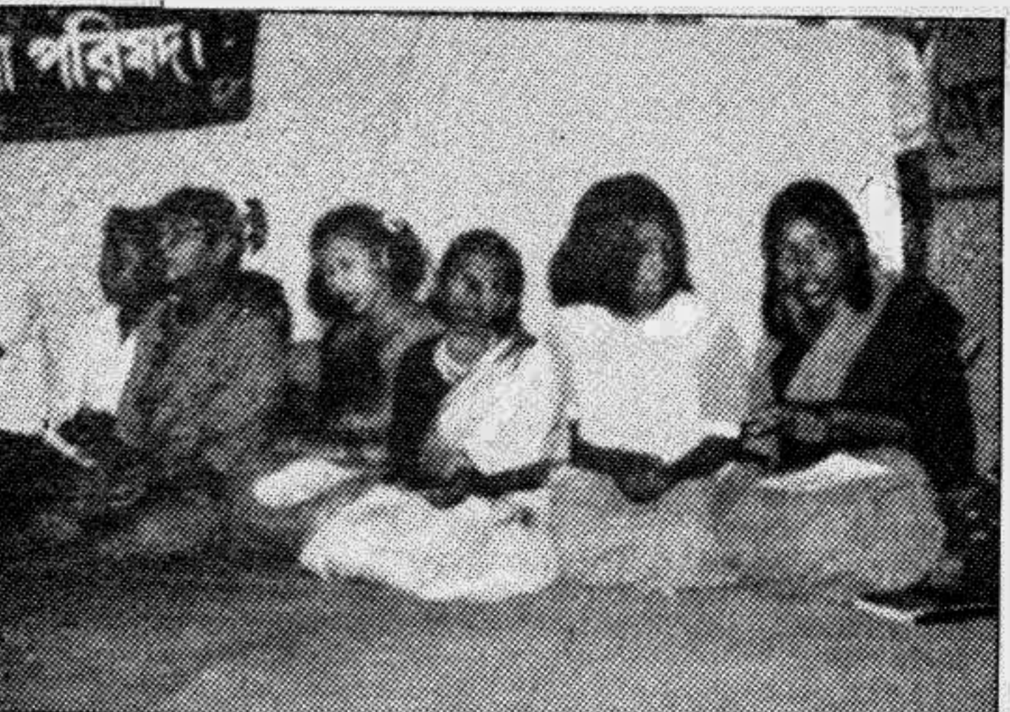
JHENIDAH: Child artistes rendering songs at a function held recently at Sailkupa thana Shilpakala Academy.

Police said the fishermen were missing after two fishing trawlers — FB Enamul and FB Haider — sank in the deep sea on June 28, according to Patharghatha Trawler Owners' Association.