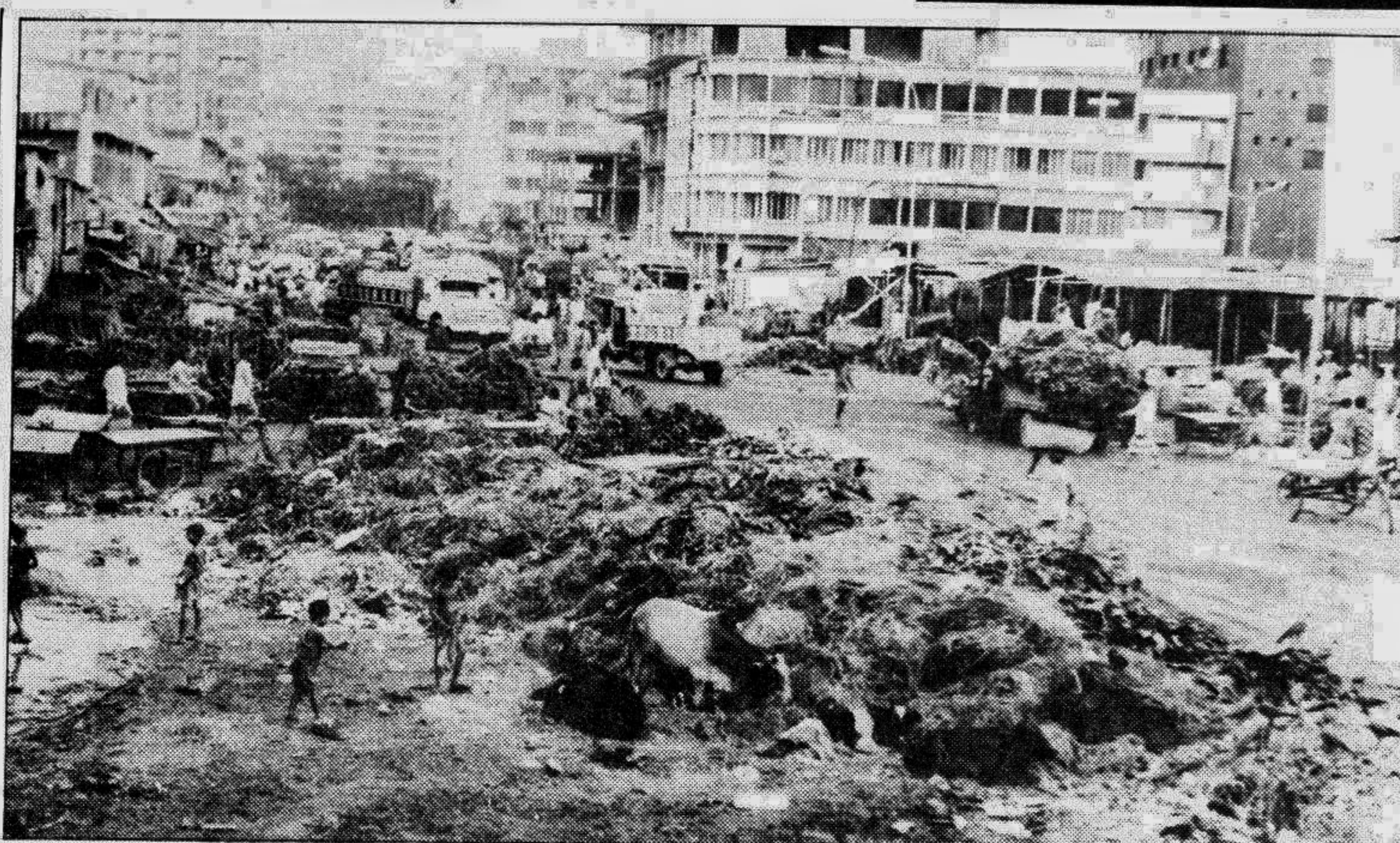
A heap of garbage has accumulated in city's Kawran Bazar area as DCC Conservancy Unit has failed to collect garbage from the area for the past few days.

A memorandum comprising suggestions of 150 teachers on the issue was handed over to Education Minister ASHK Sadeque through Joint Secretary Abdul Kalyum Thakur.