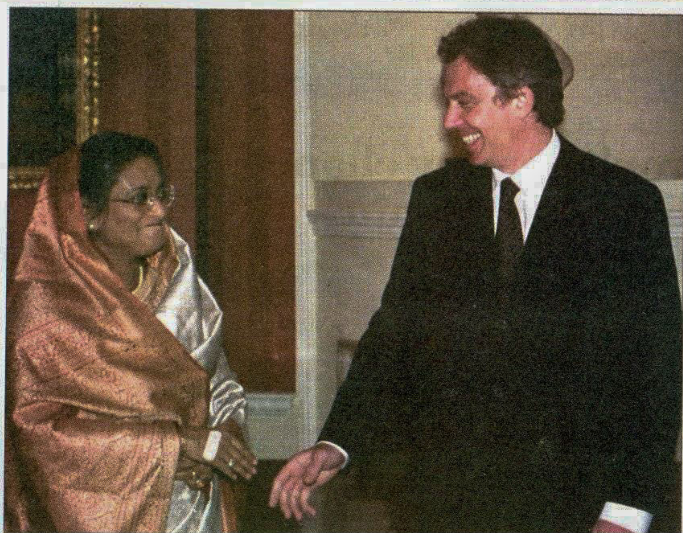
Prime Minister Sheikh Hasina (L) meets with British premier Tony Blair at 10 Downing Street in London on Wednesday.