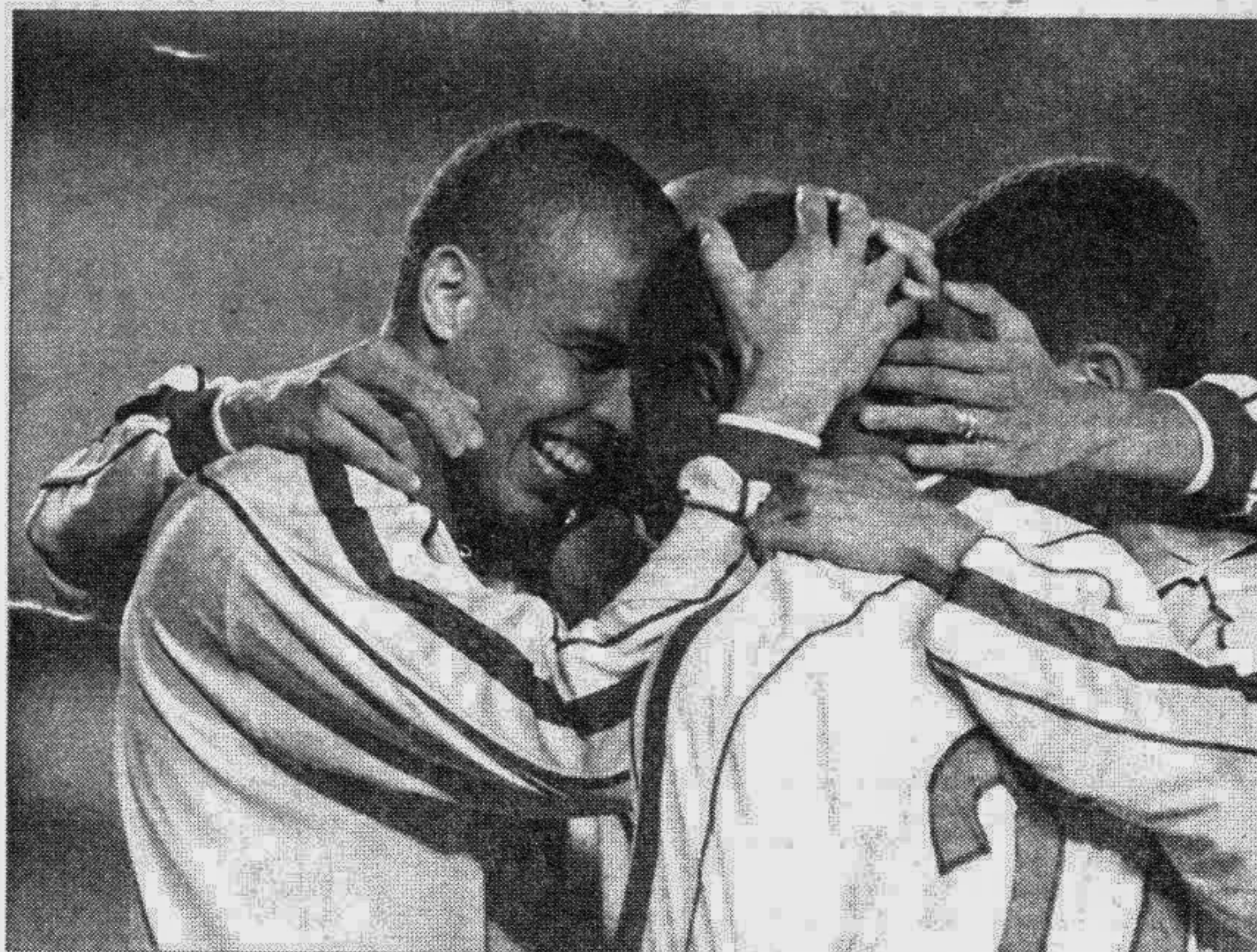
Ronaldo(L) being embraced by teammates after putting Brazil in front against Chile.