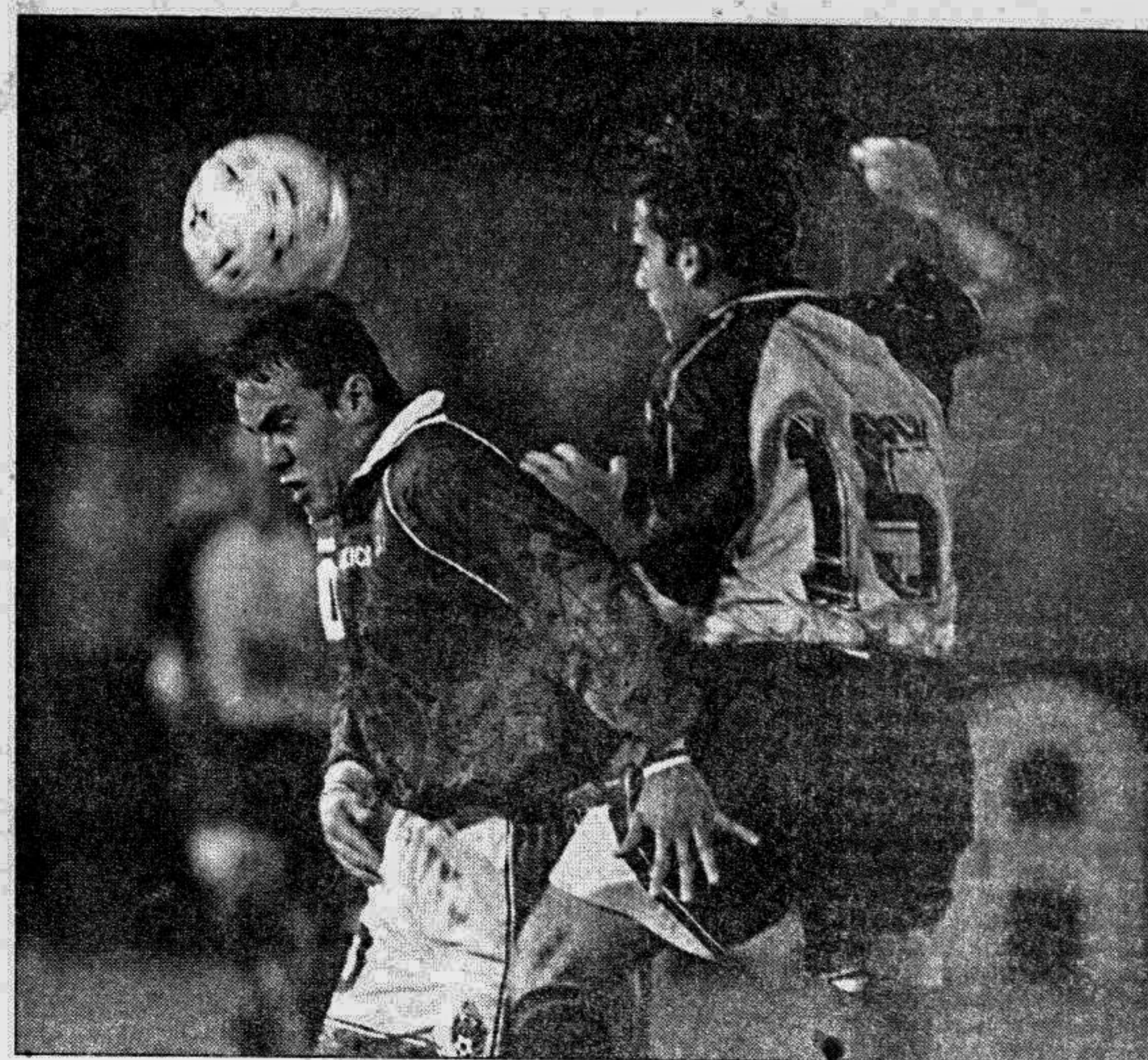
Mexico's inspirational striker Cuauhtemoc Blanco(L) under pressure from a Venezuelan defender during their Copa America encounter at Ciudad del Este on July 6.

Peruzzi had been sought by Inter's new coach Marcello Lippi, who quit Juventus in February, and joins former Turin team-mates Christian Vieri and Vladimir Jugovic in the new-look squad.