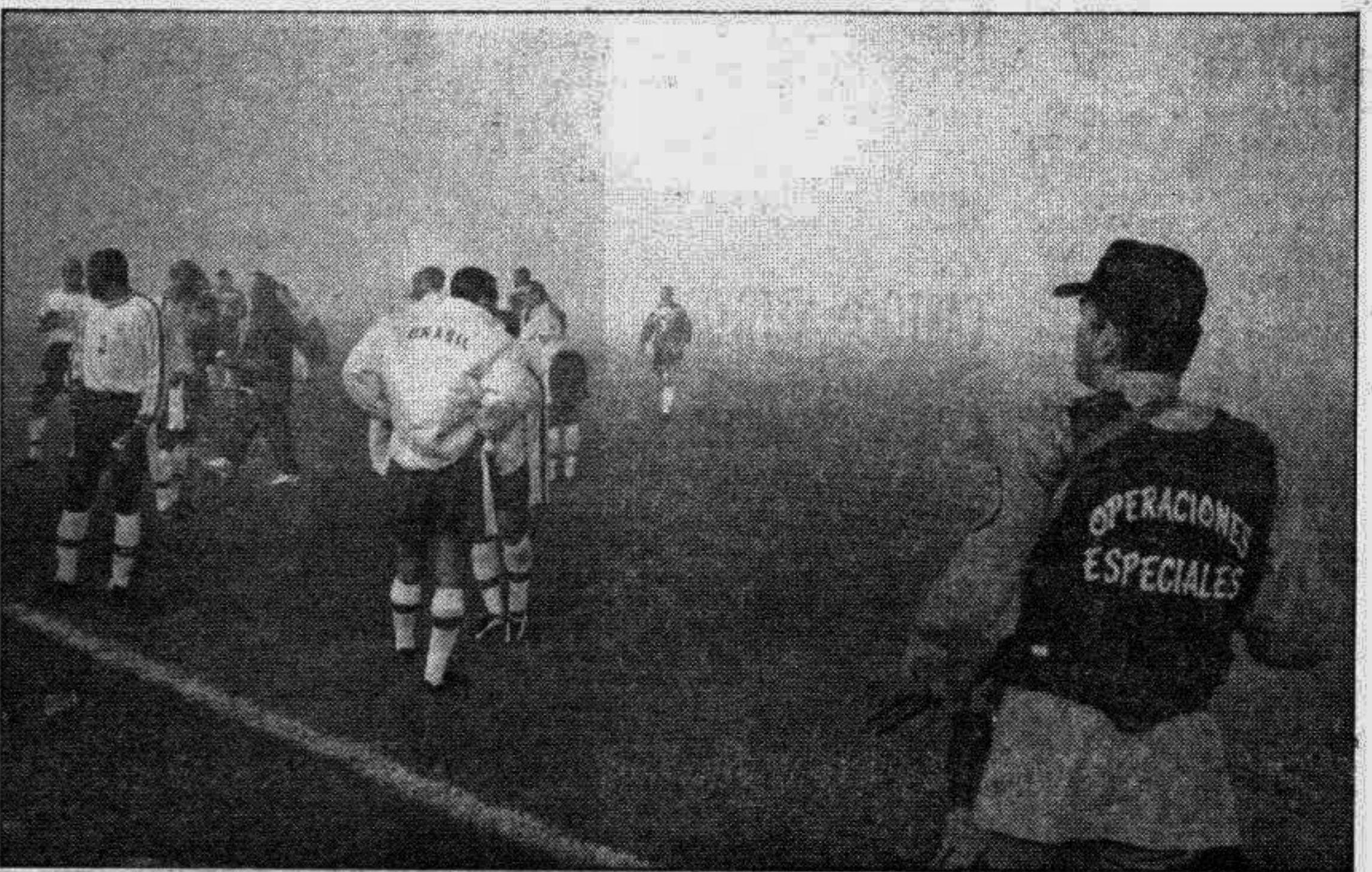
THE PICTURE SAYS IT ALL: Players stand puzzled as dense fog engulfs the ground during the Brazil-Chile match on July 6.

The Cryptogram is a substitution cipher in which one letter stands for another. If you think that X equals O, it will equal O throughout the puzzle. Single letters, short words and words using an apostrophe give you clues to locating vowels. Solution is by trial and error.