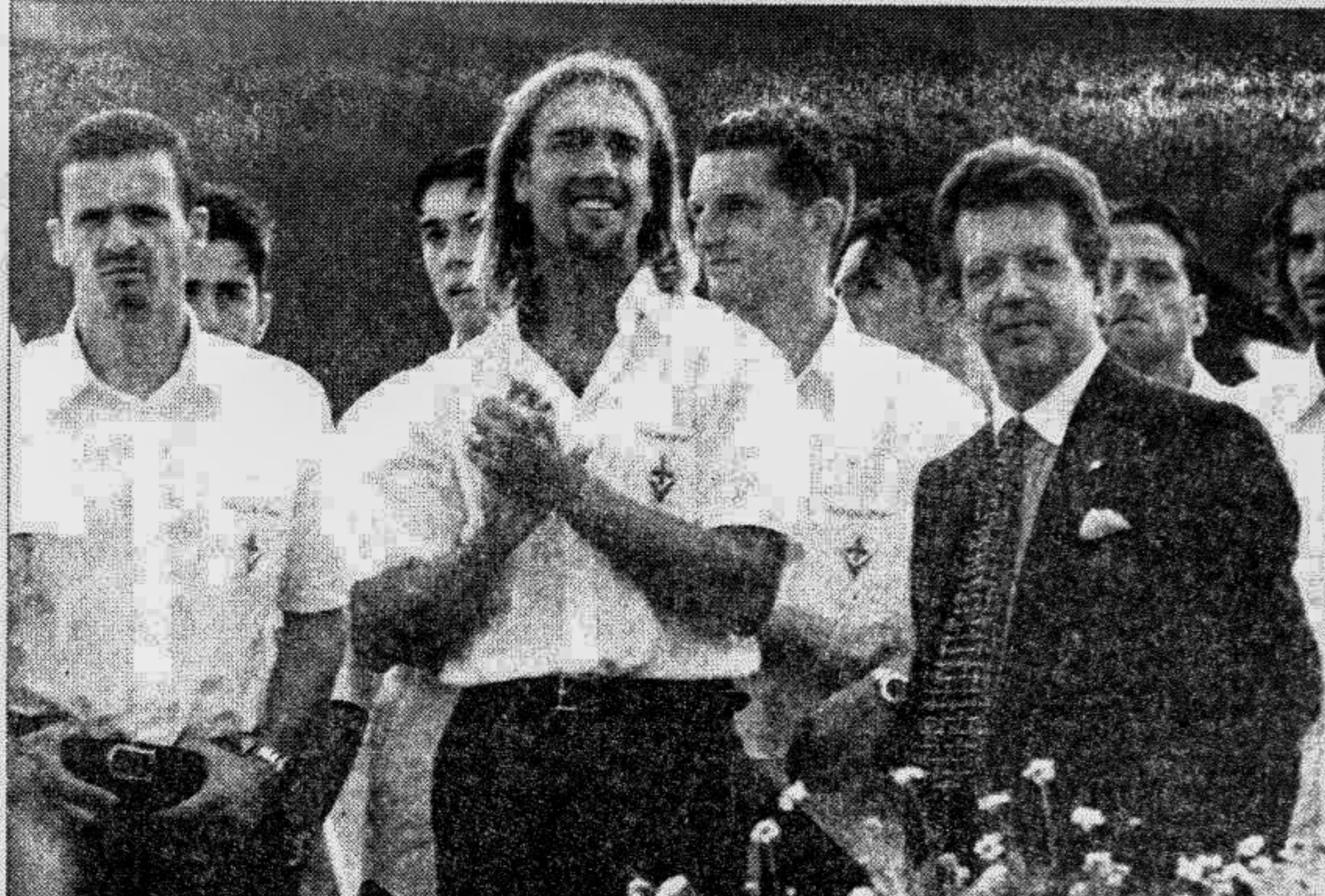
Fiorentina's Argentine superstar Gabriel Batistuta(C) being flanked by new signing Yugoslav international striker Predrag Mijatovic(L) and club president Vittorio Cecchi Gori during a presentation ceremony of the team for the 1999-2000 season at Florence on July 6.

CSKA have won the domestic league title 28 times and provide such players as Hristo Stoichkov and Emil Kostadinov, who helped guide Bulgaria to the World Cup semifinals in 1994.