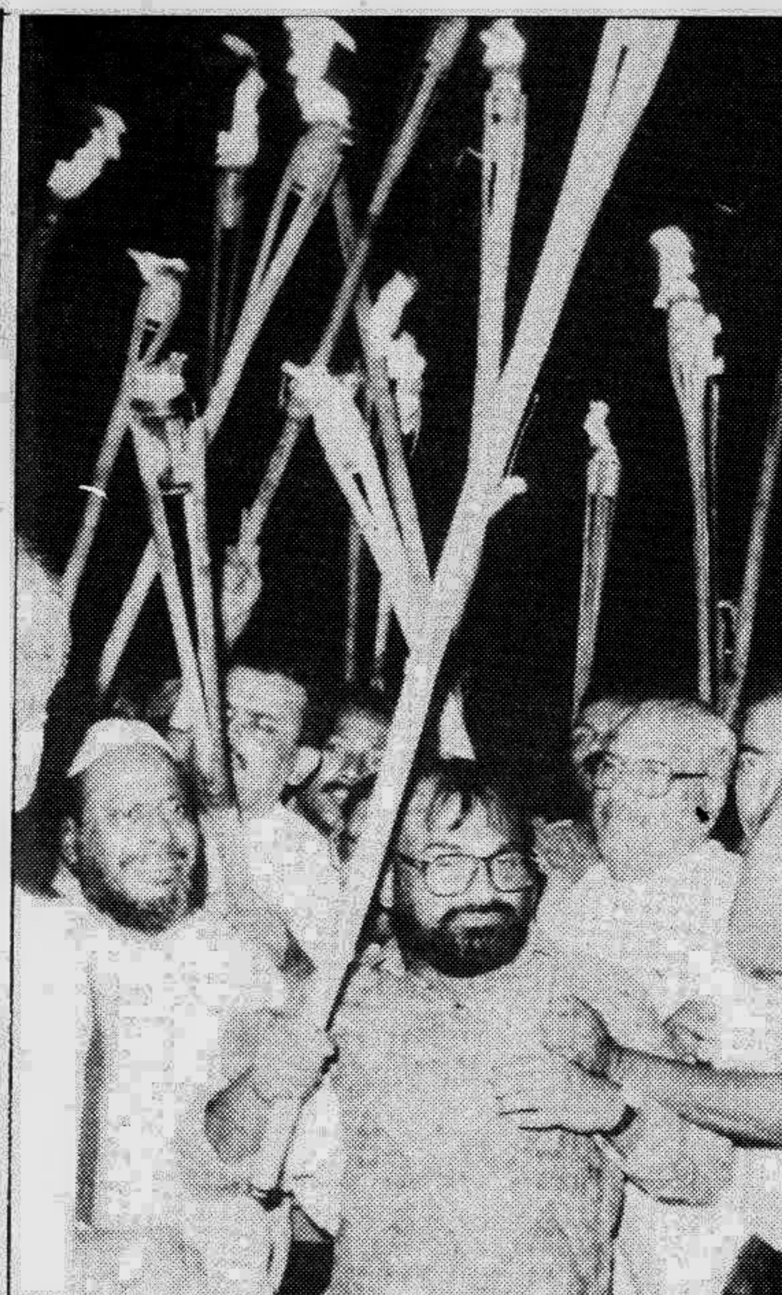
BNP brought out a torch procession in the city yesterday in support of today's hartal.

It also reviewed the progress of earlier decisions on the BSC, the Maritime Marine Department and the Bangladesh Inland Water Transport Authority (BIWTA).