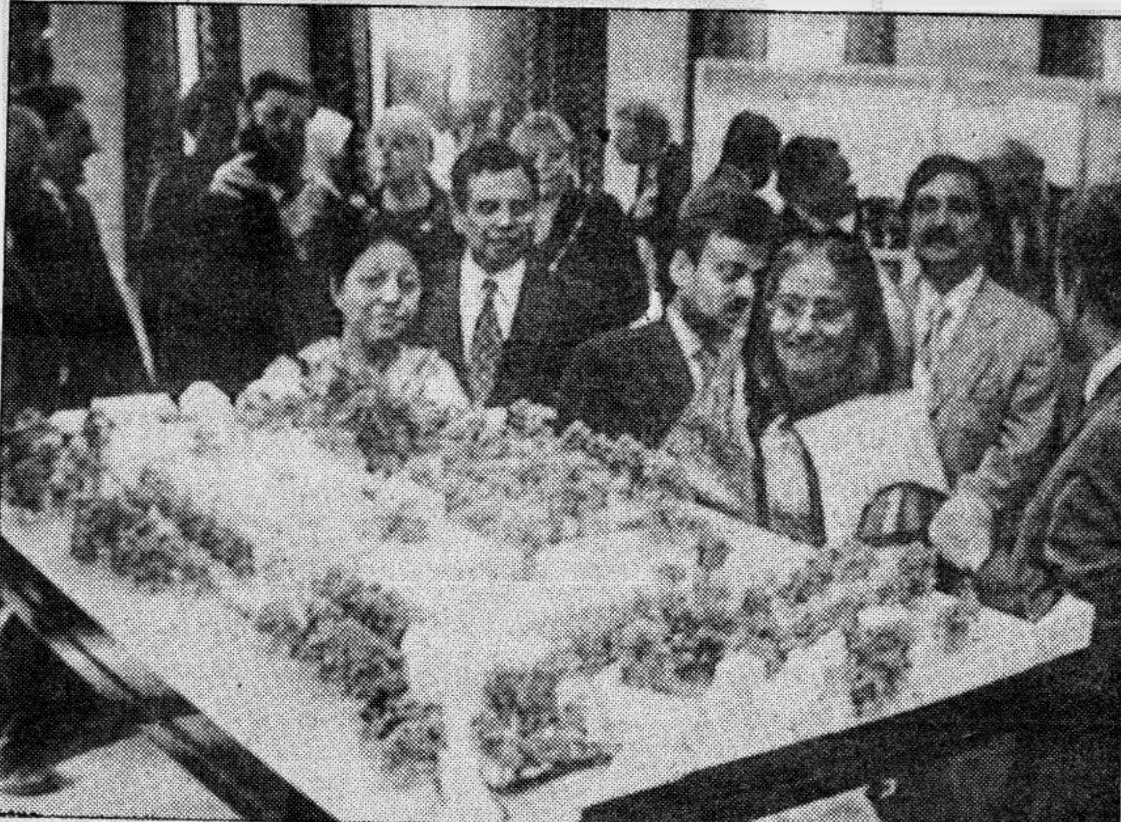
Prime Minister Sheikh Hasina visited the Oxford Centre, a Bangladesh Festival venue, in the United Kingdom on Tuesday.