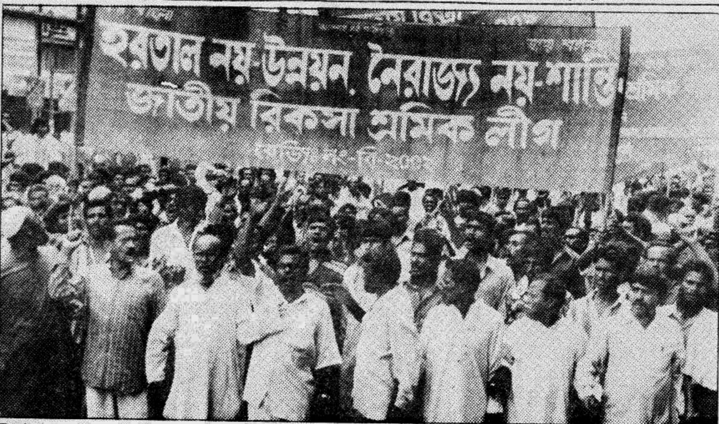
Rickshaw Sramik League brought out an anti-hartal procession in the city yesterday.

The Prime Minister later went around the Centre and signed the visitor's book. She also attended a dinner hosted by the Oxford Centre for Islamic studies.