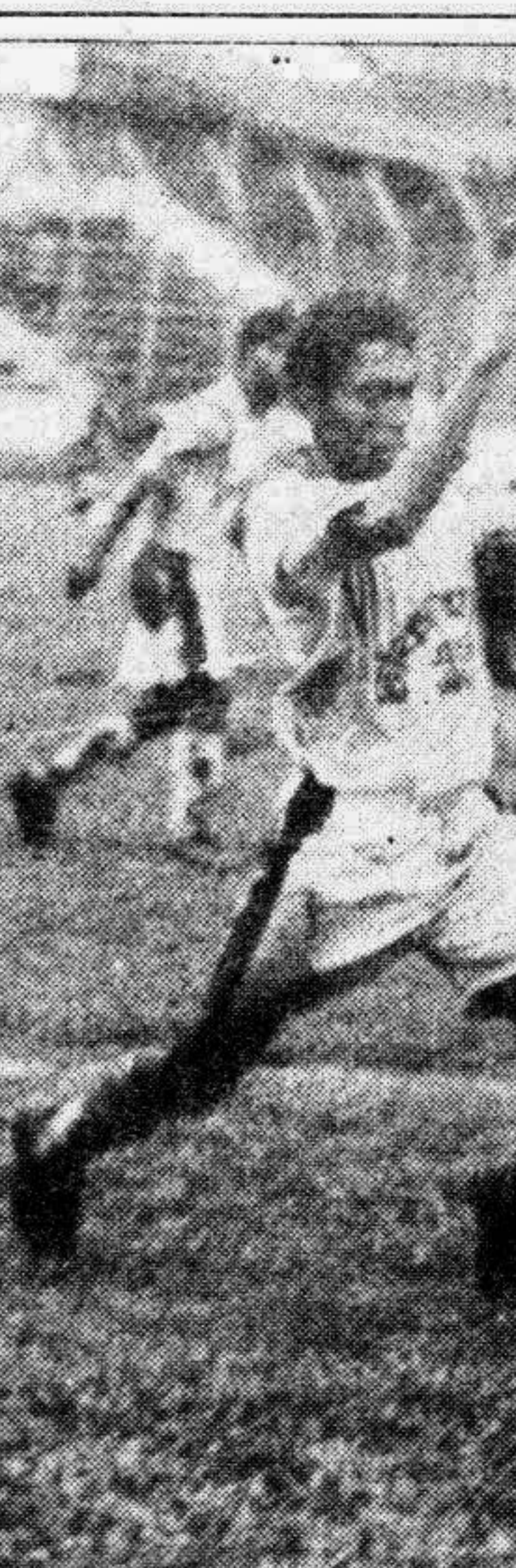
Action from yesterday's First Division soccer league match between Muslim Institute and Prantik Krira Chakra at the Bangabandhu National Stadium.

The deal comes amid days of meetings leading up to the Women's World Cup final on Saturday.