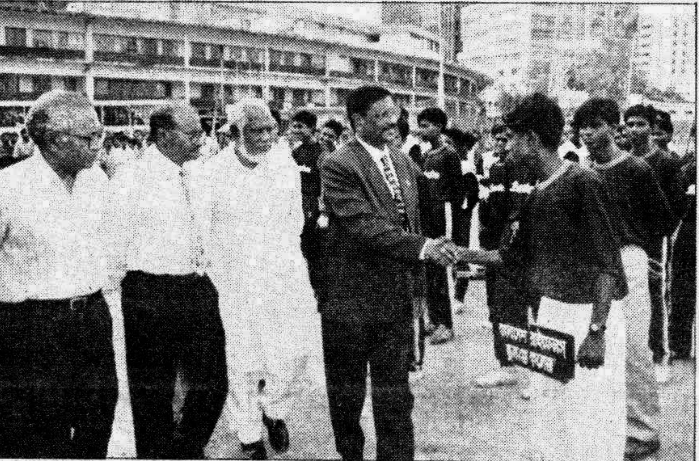
State Minister for Youth and Sports Obaidul Quader being introduced to the participants of schools handball tournament for boys yesterday.