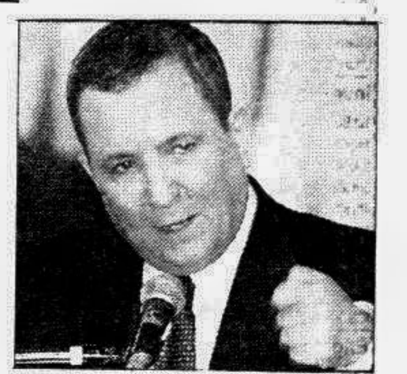
Israeli Prime Minister-elect Ehud Barak speaks to the Labour Party central committee meeting in Tel Aviv after the committee approved his ministerial list Monday, one day before the list is presented to parliament.

"The government will respect agreements Israel signed with the Palestinians and will insist that the Palestinians implement the agreements too," the guidelines said.