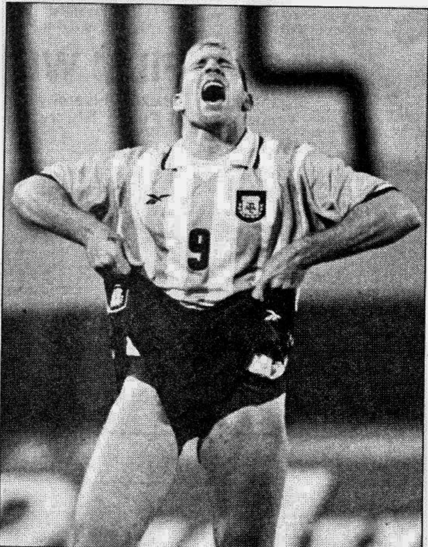
Argentina's prolific striker Martin Palermo is furious after missing the second penalty shot against Colombia on July 4.

But Palermo is quite capable of confounding his critics yet again.