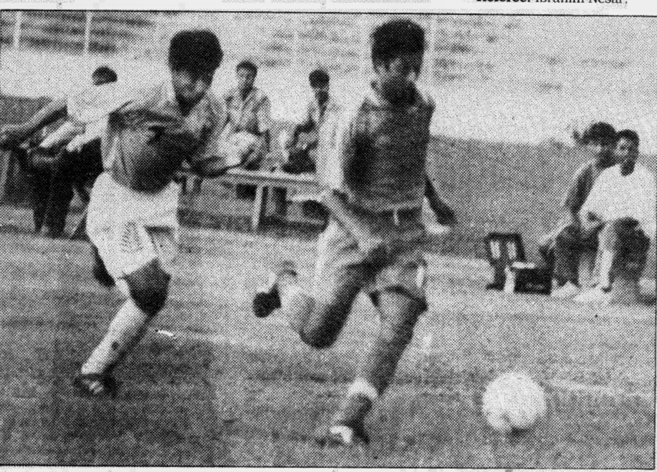
Action from the Premier Division football league match between Muktijoddha Sangsad and Rahmatganj at the Bangabandhu National Stadium yesterday.