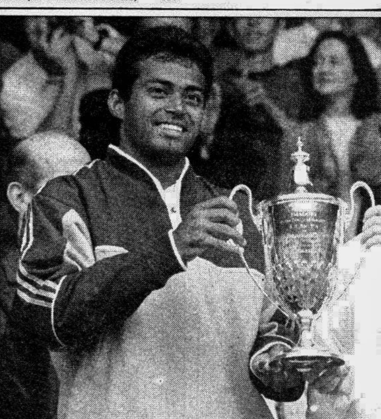
Indian Leander Paes (L) and American Lisa Raymond show the mixed doubles' trophy of the Wimbledon after the final on July 4. The pair beat Jonas Bjorkman of Sweden and Russian Anna Kournikova 6-4, 3-6, 6-3.