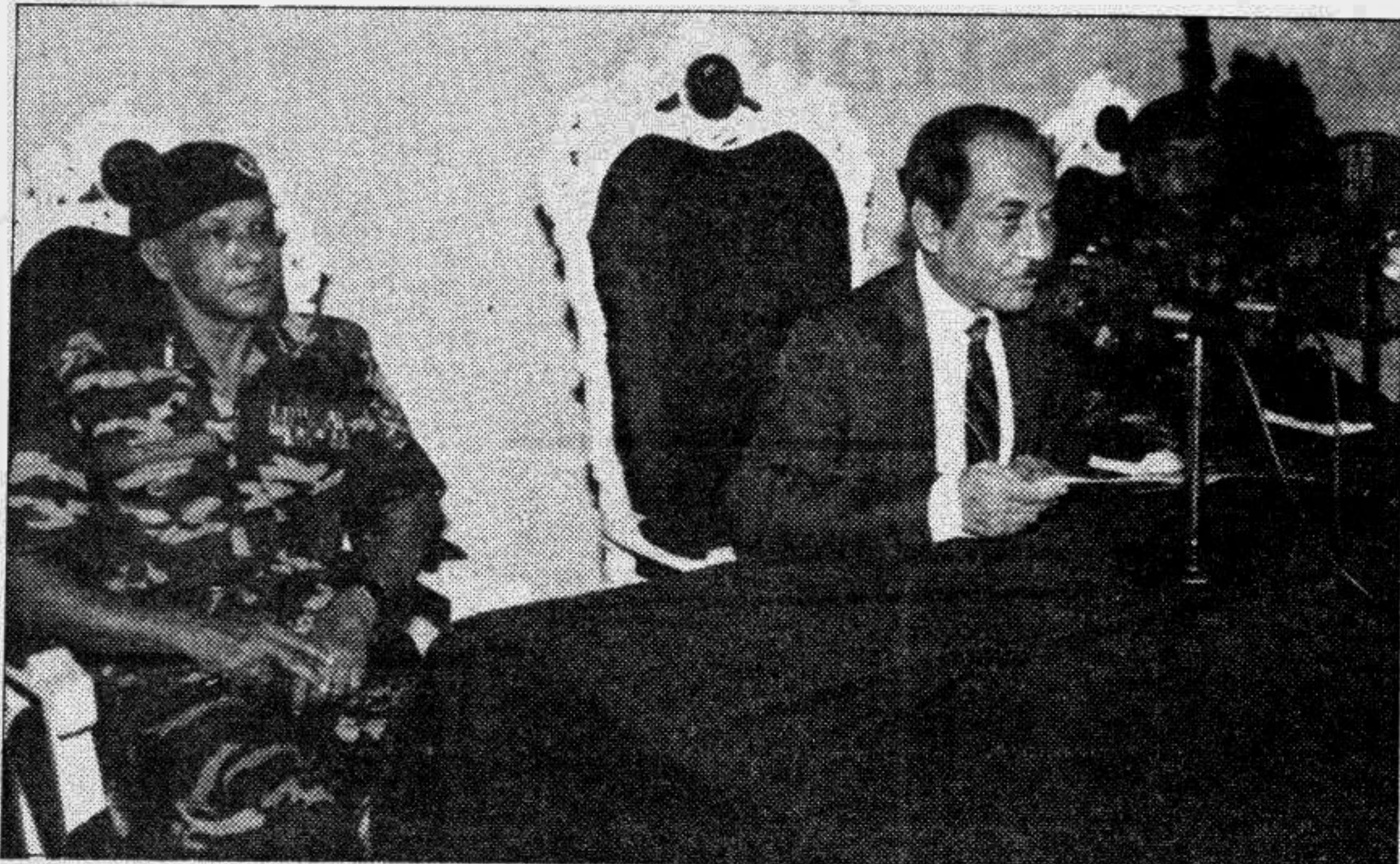
President Shahabuddin Ahmed addressing the 24th founding anniversary of President Guard Regiment at the Dhaka Cantonment yesterday.