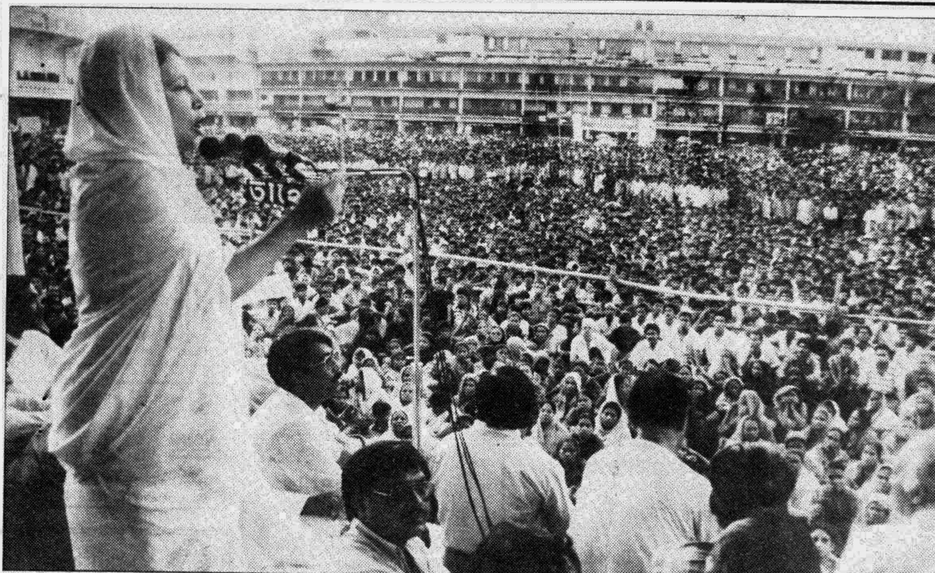
BNP Chairperson Begum Khaleda Zia addressing a public meeting at Paltan Maidan in the city's yesterday.