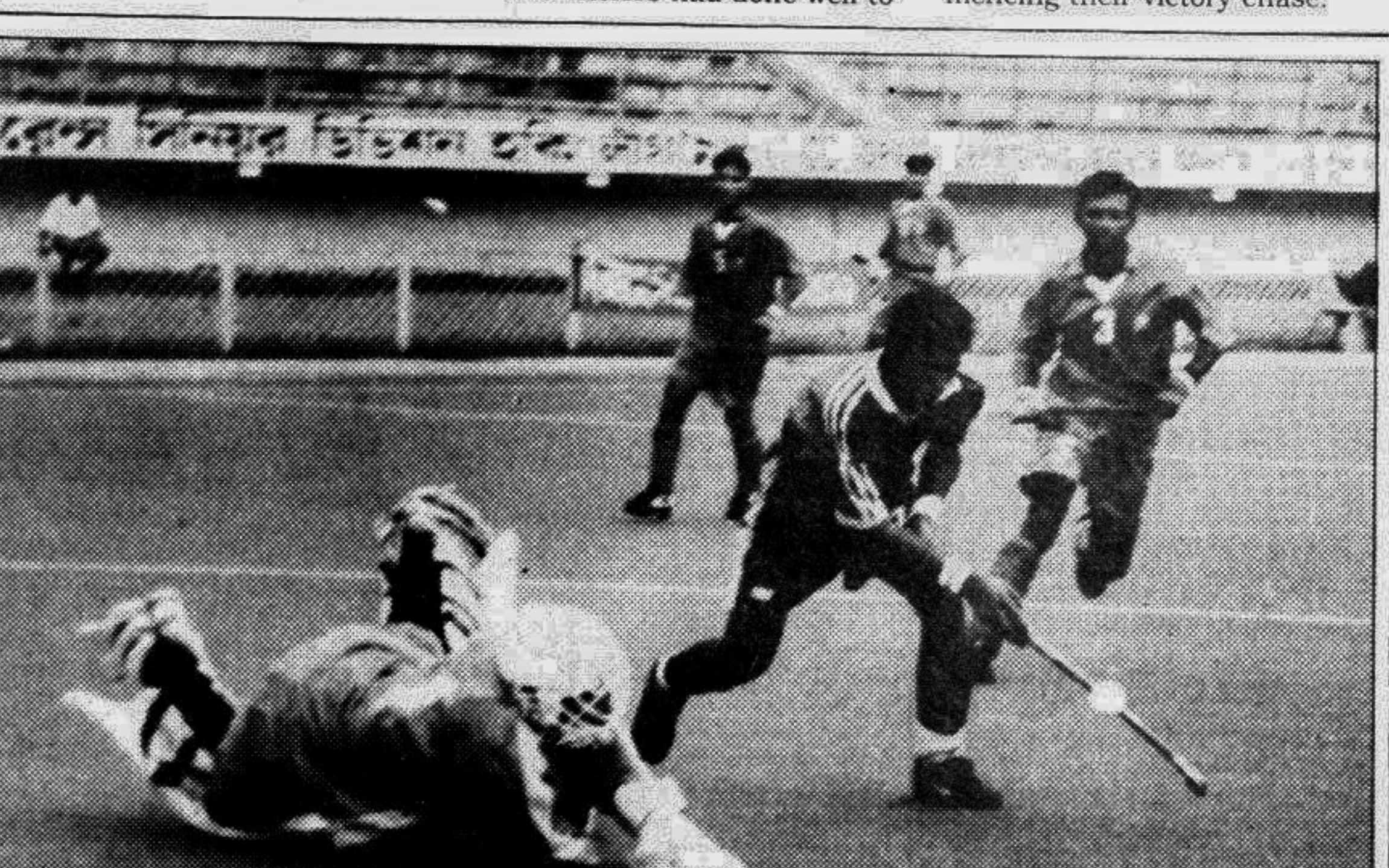
Action from yesterday's national championship encounter between Bangladesh Army and Faridpur.