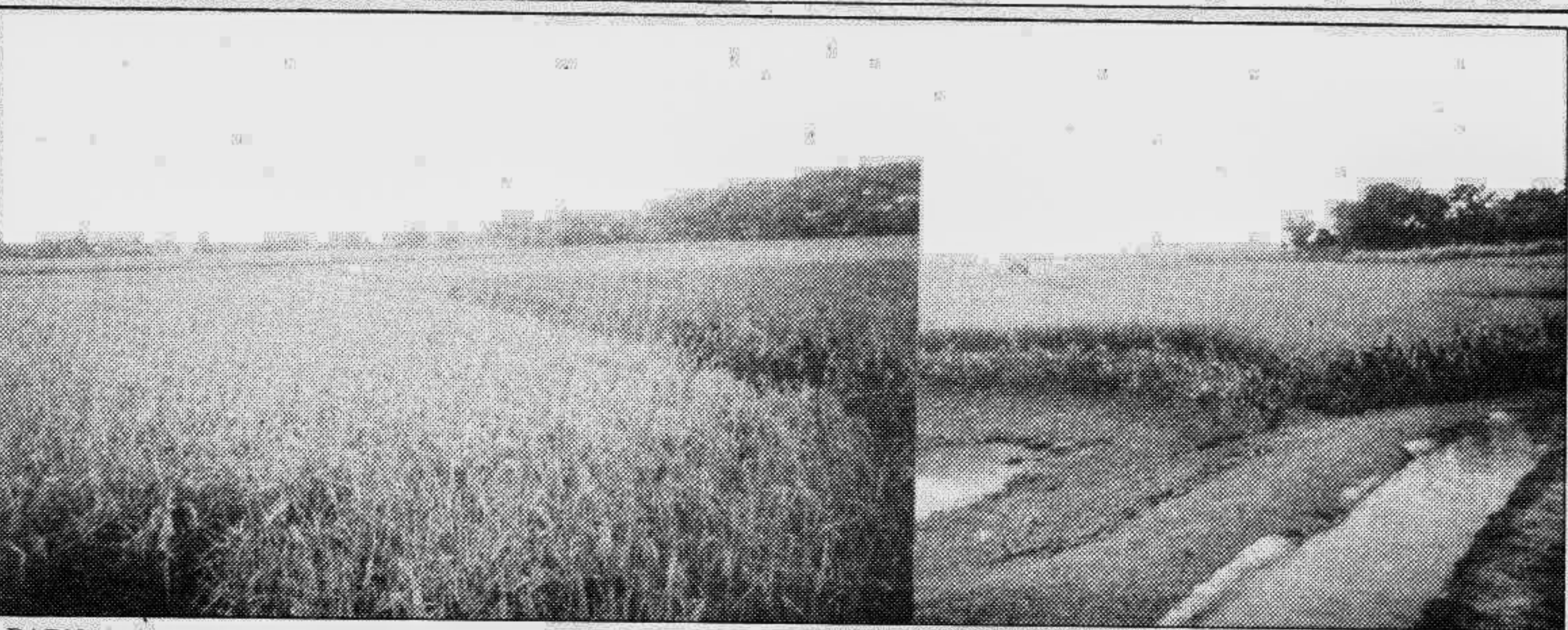
PABNA: (L-R) Bumper production of IRRI-Boro paddy has been achieved this year in Bera and Faridpur thanas. Farmers could not grow Boro paddy on fields in these two thanas during the previous years.

He was wanted by police for quite a long time, police said.