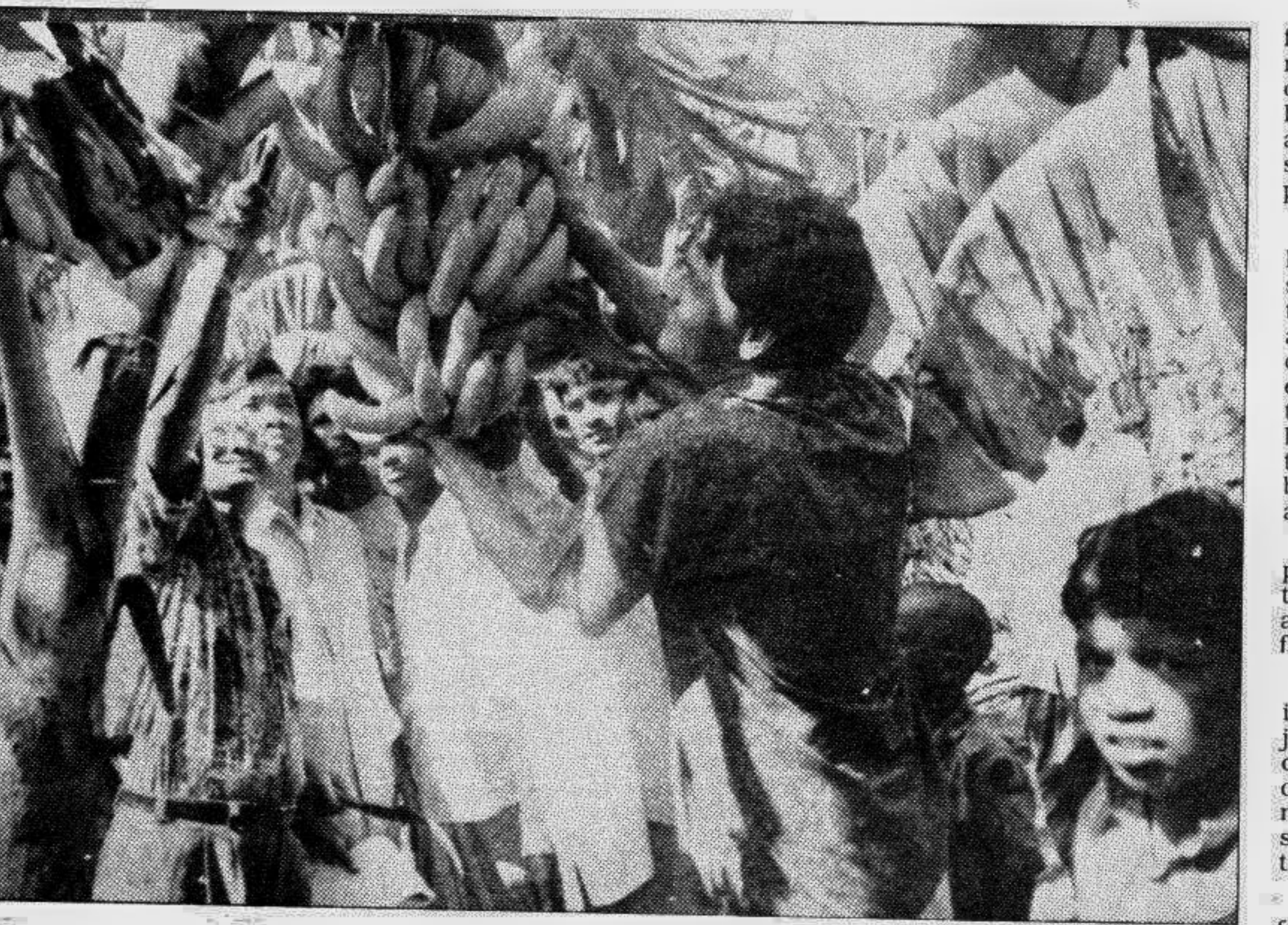
Banana being collected from a garden at village Binander Para in Jamalpur sadar thana.

But for banana no special effort is necessary for our soil and climatic suitability for its plantation. It has been proved beyond any doubt.