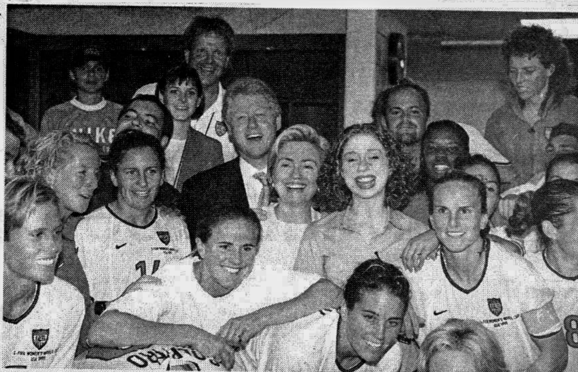
CLINTONS JOIN THE CELEBRATION: US President Bill Clinton, First Lady Hillary Clinton and daughter Chelsea celebrate the national women booters' World Cup quarterfinal triumph over Germany in the dressing room of the Jack Kent Cooke Stadium in Madison on July 1.