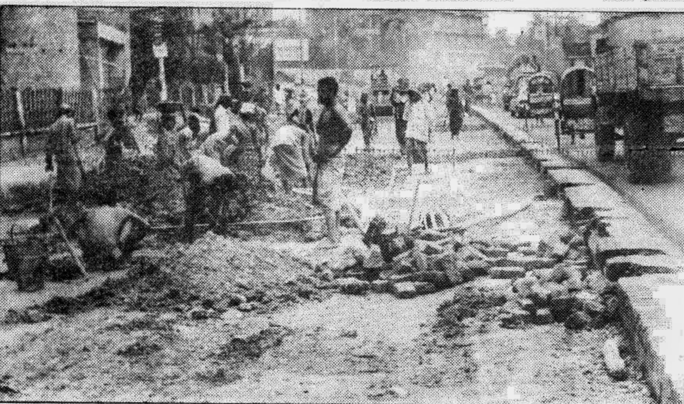
Repair work for extensively damaged portion of the road at the Swamibagh crossing in the city going on.