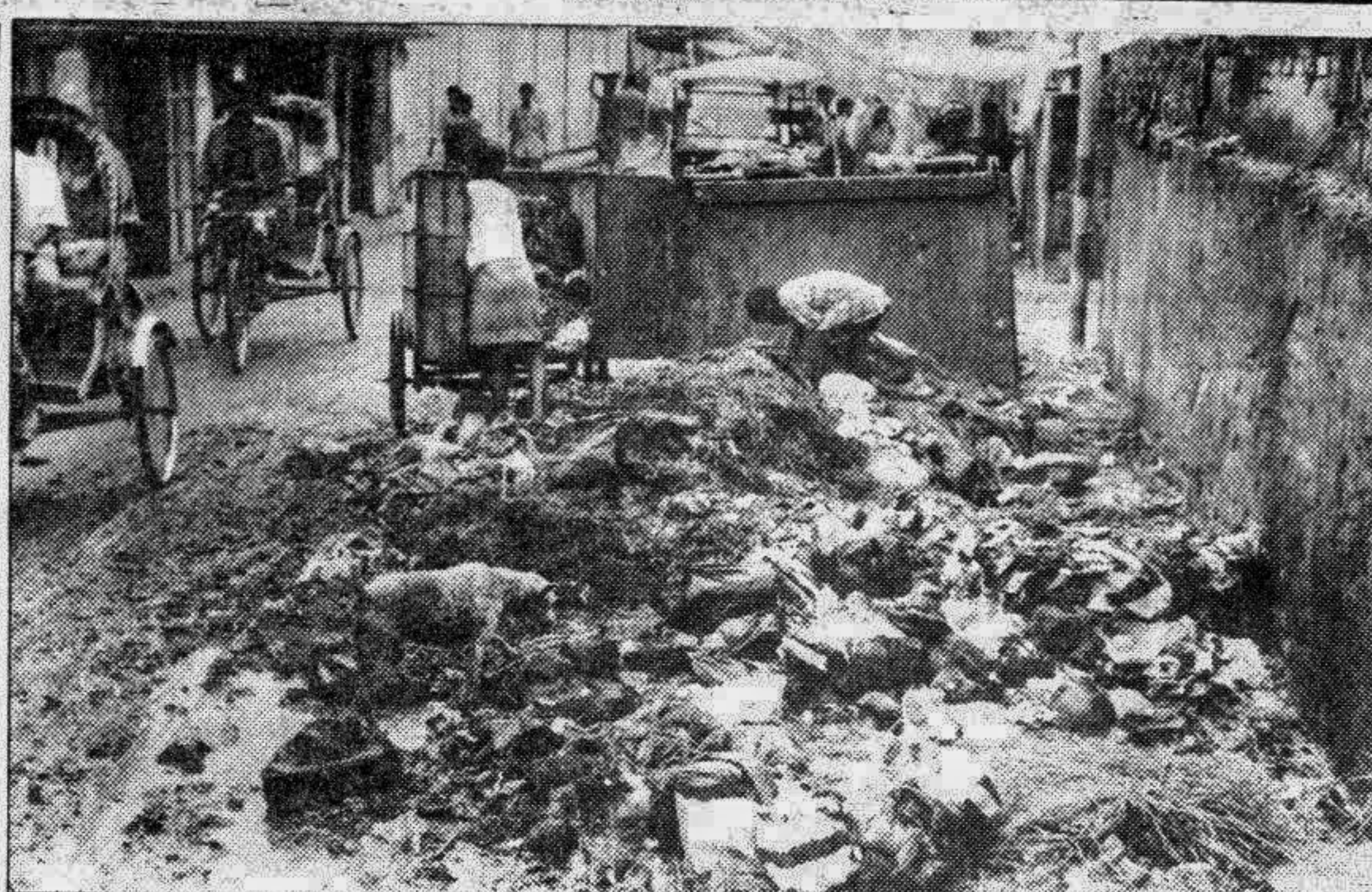
Filthy garbage litters three-fourth of the busy Purba Mothertek road causing inconvenience to the road users. Local residents allege that cleaners usually turn up once in 3 to 4 days.

The function was followed by the annual drama 'Bearing Chitthi', organised by the Sports, Cultural and Welfare Council of the REB.