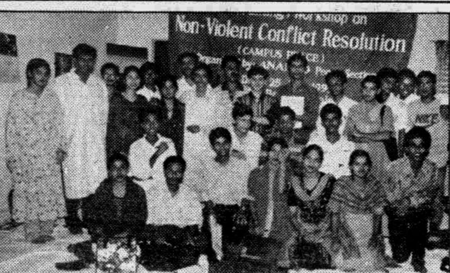
Non-Violent Conflict Resolution training was held in ADSCO, Banani, in the city, organised by ANANDO recently. Participants are seen during the training.