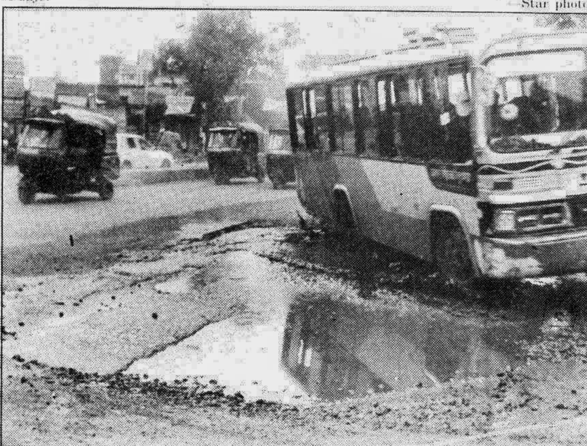
Incessant rains for days together has caused extensive damage to the city roads. Picture shows a big pothole on the Biswa Road near Golapbagh playground.