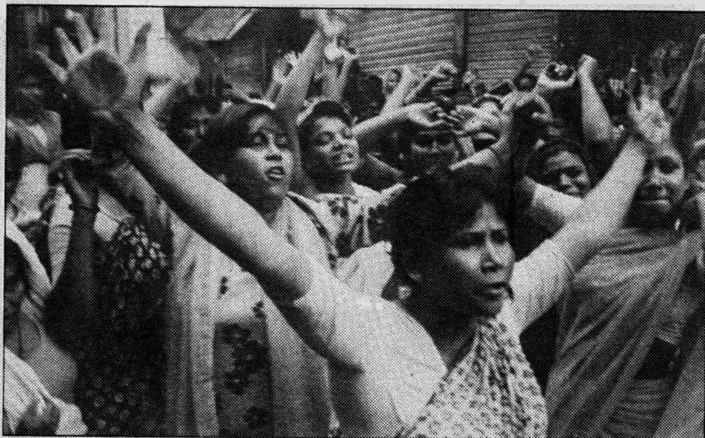
Inmates of Tanbazar Brothel staged a demonstration in Narayanganj town yesterday protesting murder of a fellow inmate inside the brothel.