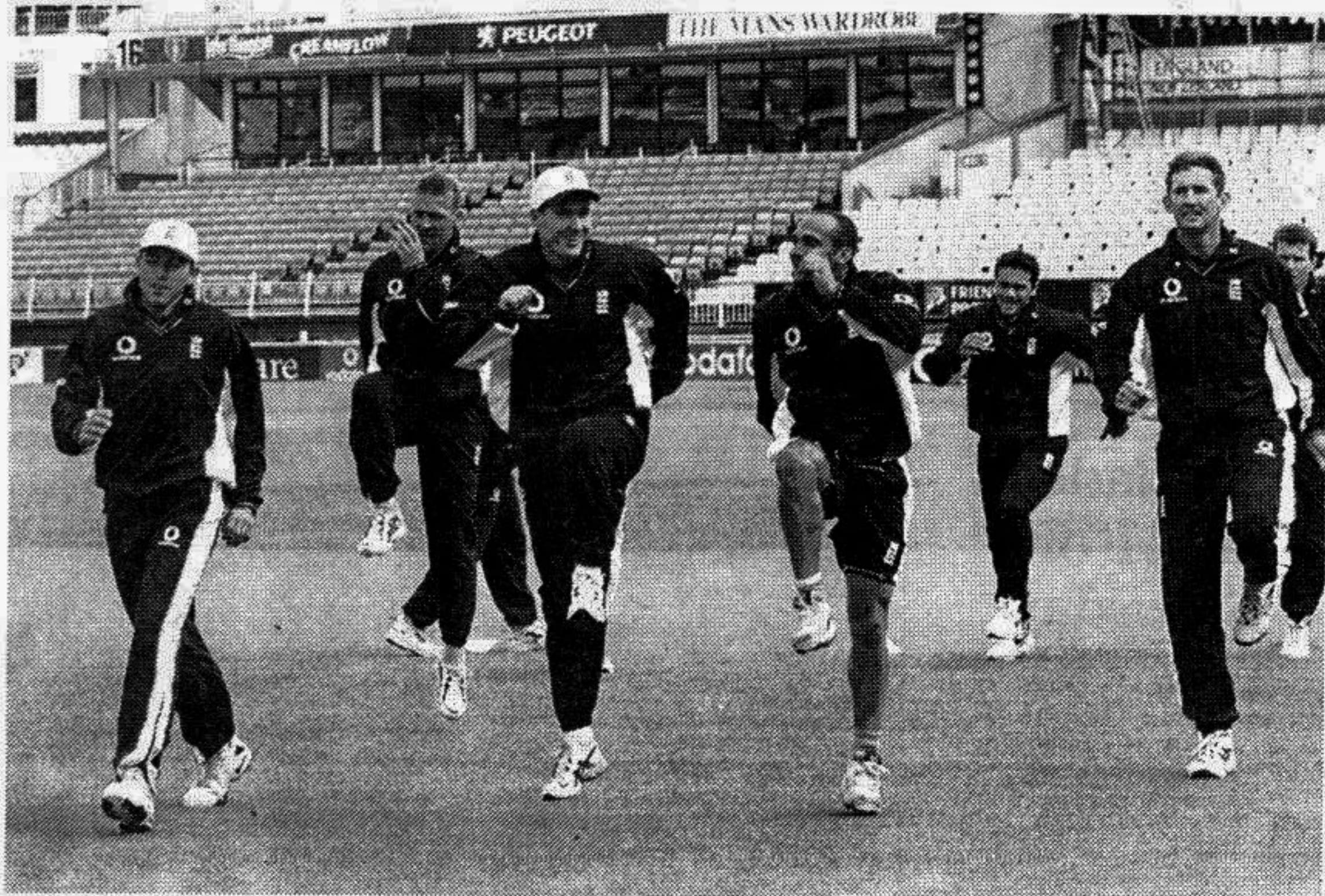
England cricketers limbering up during a practice session at Edgbaston yesterday.

Van Hooijdonk has been transfer-listed since last August when he refused to return to the English club, who were then in the premier league, for three months after the World Cup finals in France.