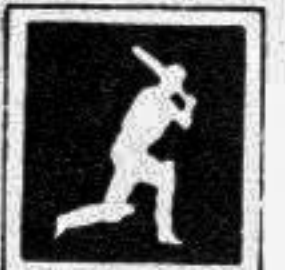
LONDON, June 30 (Internet report): Darren Gough has backed new England captain Nasser Hussain to dispel the World Cup disappointment with victory over New Zealand in the first Test at Edgbaston.

England failed to reach the Super Six stage of the tournament, leading to the departure of Alec Stewart as captain.