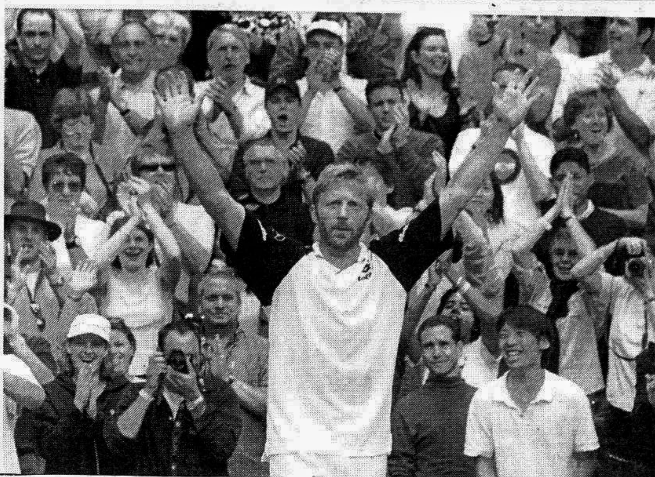
BECKER BIDS BYE: German legend Boris Becker raising his hands for the last time before his favourite Wimbledon crowd after losing the fourth round tie against Aussie Patrick Rafter yesterday.

Qayyum's second inquiry is expected to be wrapped up sometime in July and that report will be given to Pakistan's conservative President Rafiq Tarar.