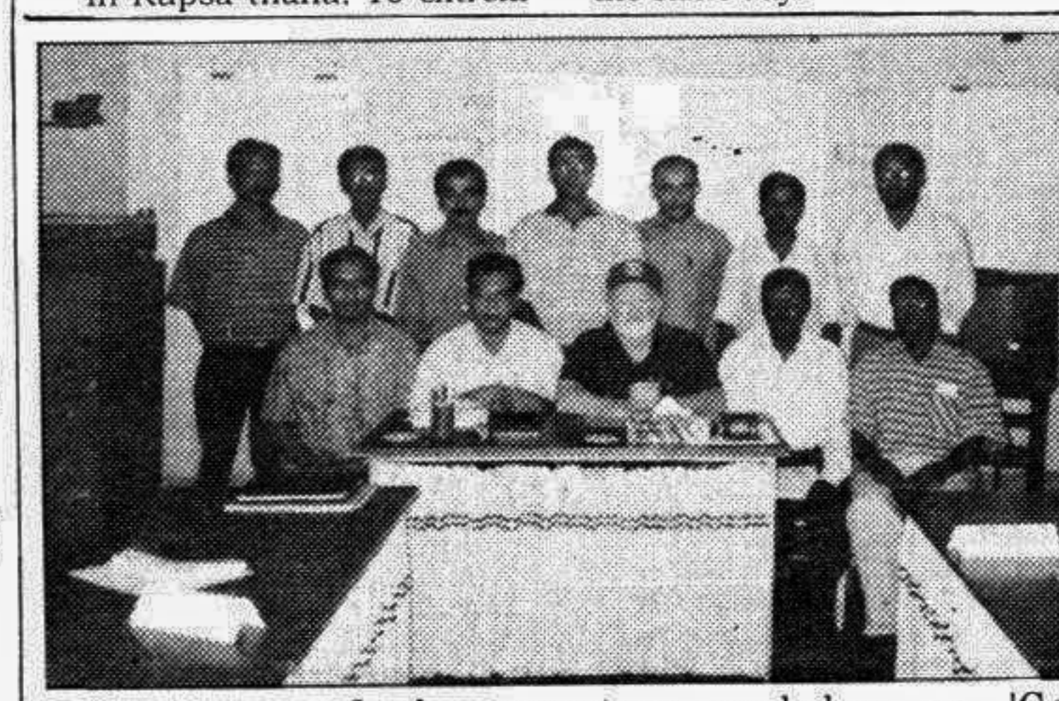
Participants of the reporters workshop on 'Gas Development Issues' organised by BCDJC and ICFJ.