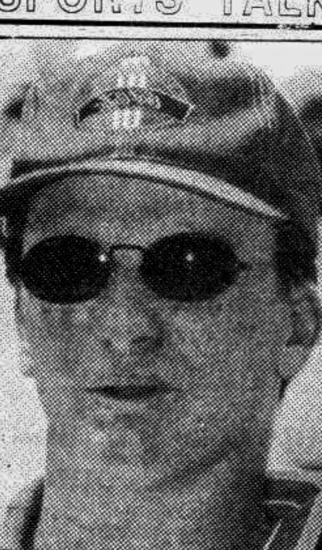
Steve Waugh (Australia cricket captain) "Sometimes teams get written off too early, sometimes too much is written about some sides... Other teams should be more concerned about us."