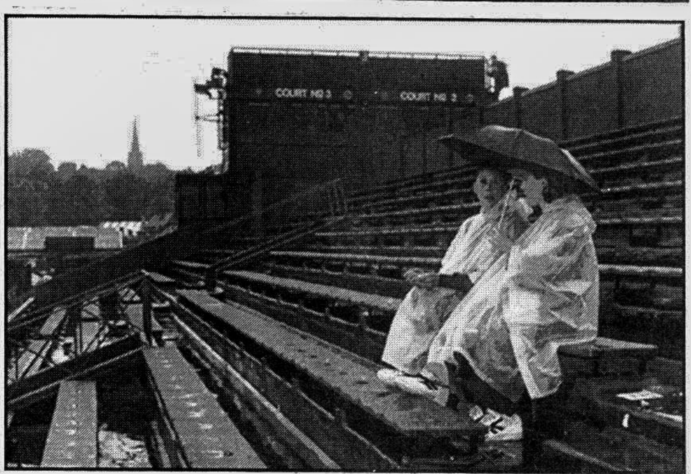
A couple of fans wait patiently for the rain to stop yesterday.