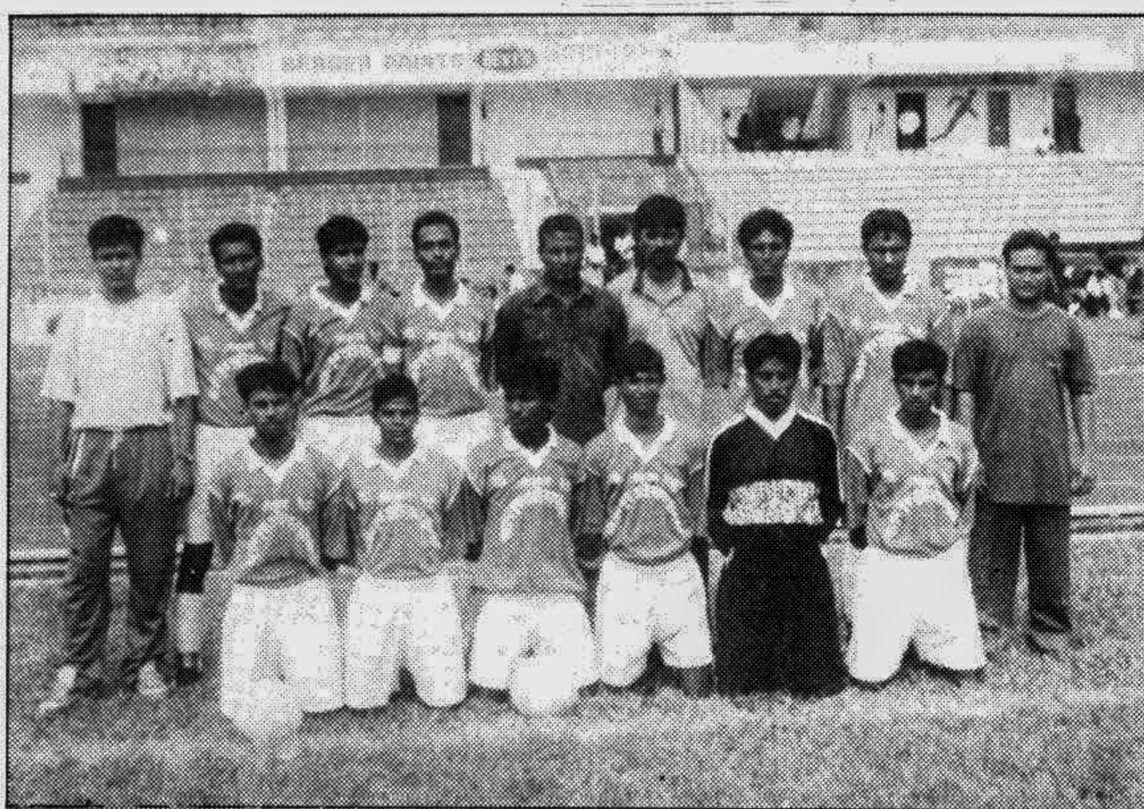
Players and officials of the Kasaituly Samajkalyan Parisad, who became champions in the Third Division super league yesterday.

Earlier, Victoria defeated Prantik KC in their first appearance in the league.