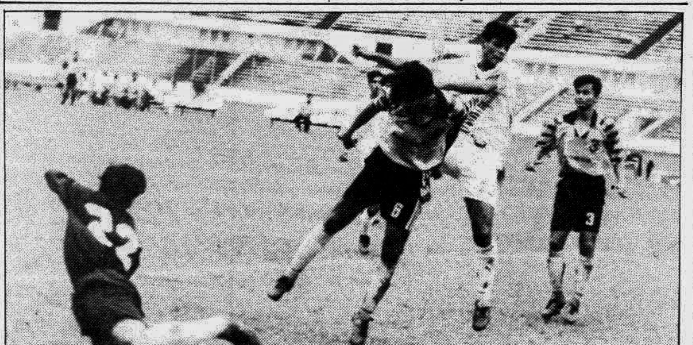
Action from yesterday's First Division football league match between Dhanmondi and Victoria at the Bangabandhu National Stadium.