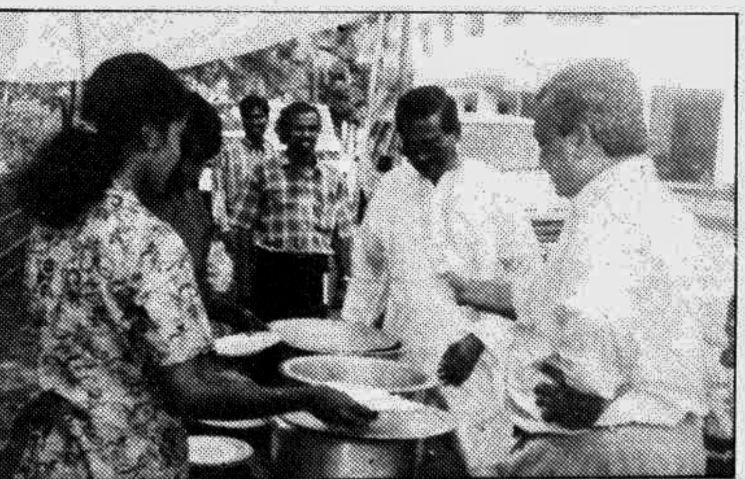
COX'S BAZAR: A cake festival was arranged here recently under the auspices of Cox's Bazar Cultural Centre.