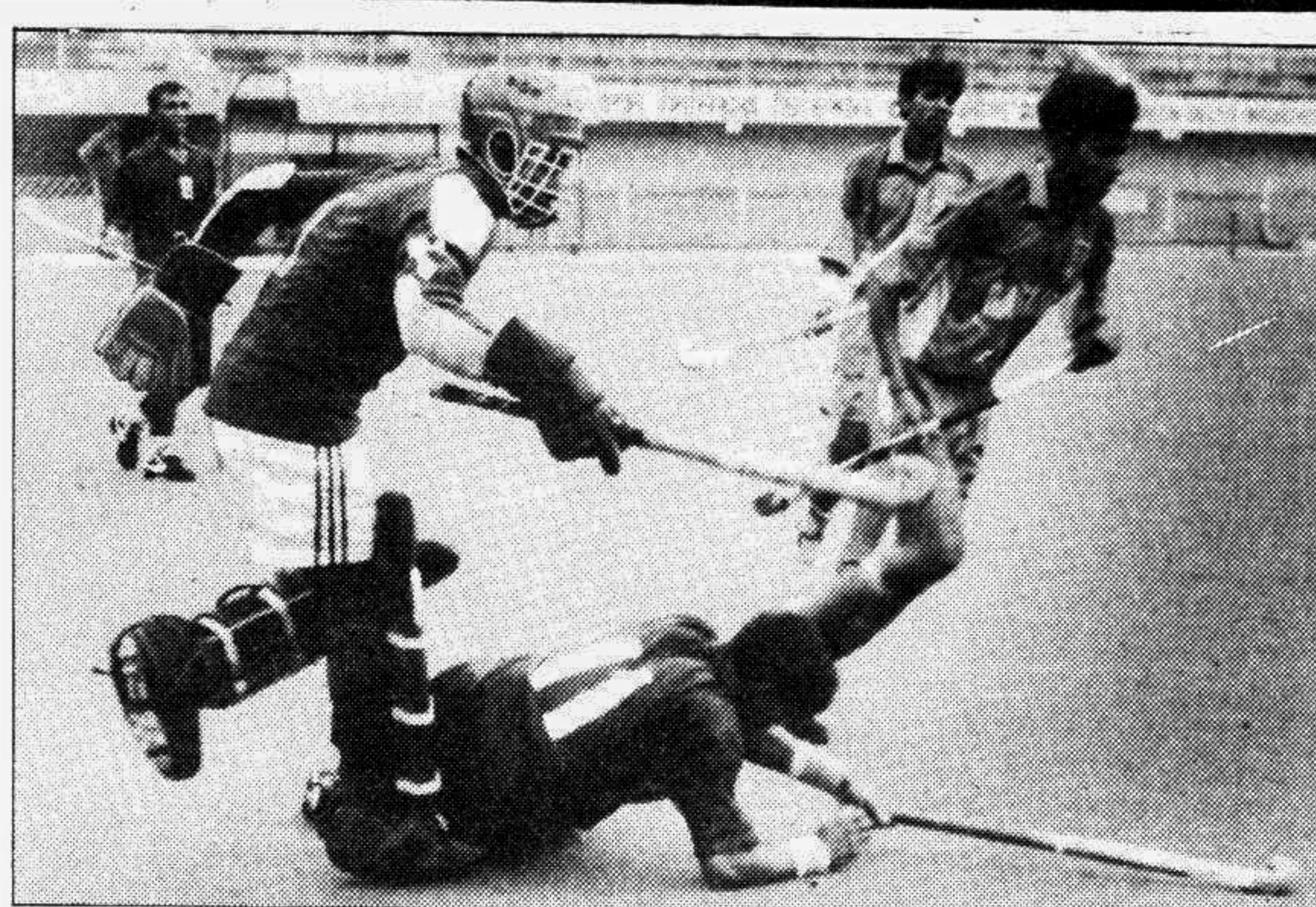
Action from yesterday's national hockey championship match between Rajshahi and Bangladesh Army at the Moulana Bhasani National Stadium.